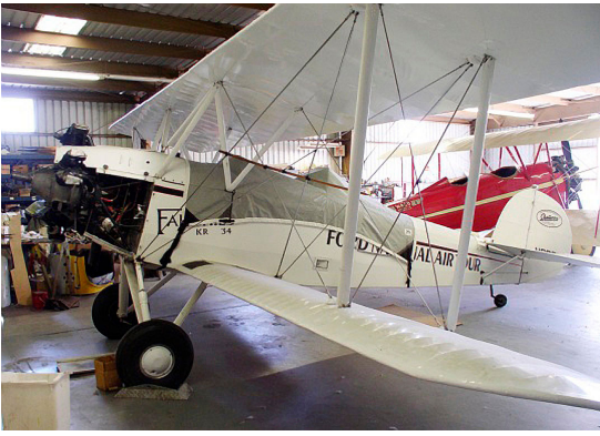
Fairchild KR-34 Canopy Cover