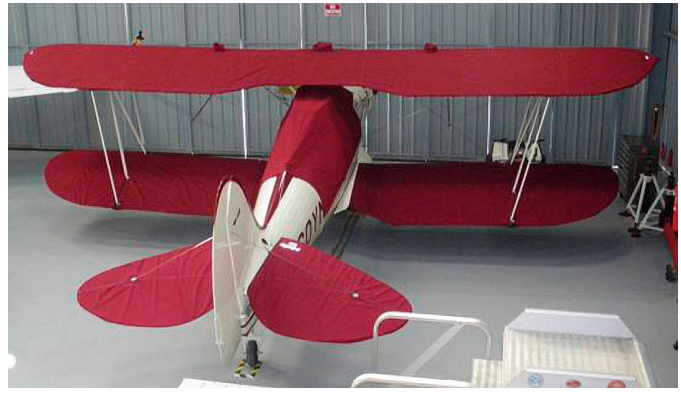
Waco UPF-7 Upper/Lower Wing Cover, Horizontal Stabilizer Cover, & Canopy Cover