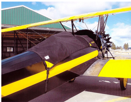
Stearman C3 Canopy Cover