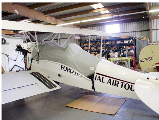
Fairchild KR-34 Canopy Cover