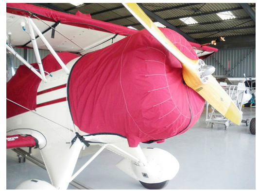
Waco UPF-7 Engine Cover