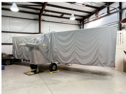
Stearman PT-13 Full Body Dust Cover, Prop Cover Included

Some high value aircraft end up logging lots of hangar time, and become dust magnets in the process. A high quality, well fitting dust cover provides easy assurance that the aircraft's surfaces remain clean and free of grit and grime. Available in a large variety of colors, each dust cover is custom made according to aircraft details and customer preferences. Fire retardant fabrics are also available.