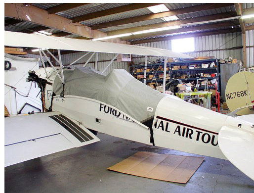
Fairchild KR-34 Canopy Cover