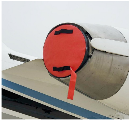
Gulfstream G100 Exhaust Plugs