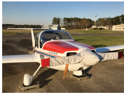
Grob 109 Prop Cover