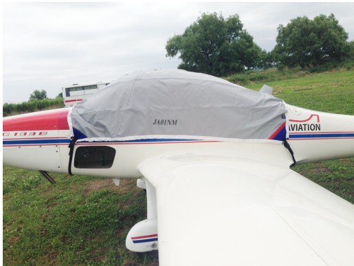
Grob 109 Travel Cover, Light Weight Travel Canopy Cover