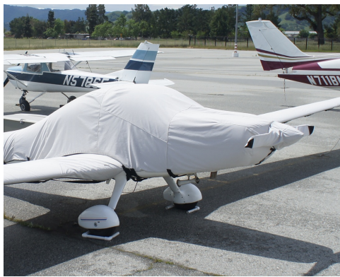
Grob 109 Prop Cover