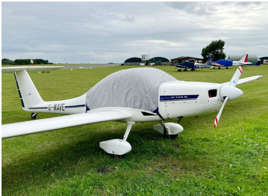
Grob 109 Travel Cover, Light Weight Canopy Cover