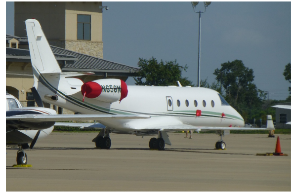
Gulfstream G150 Engine Cover Set