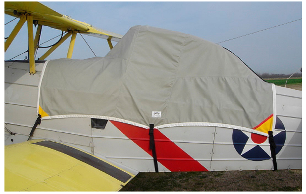
Grumman Ag-Cat Canopy Cover