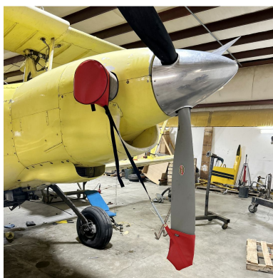
Schweizer Ag-Cat Prop Tie/Exhaust Cover Set