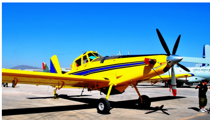
Air Tractor Prop Tie/Exhaust Covers