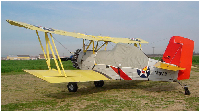
Canopy Cover for the Grumman Ag Cat