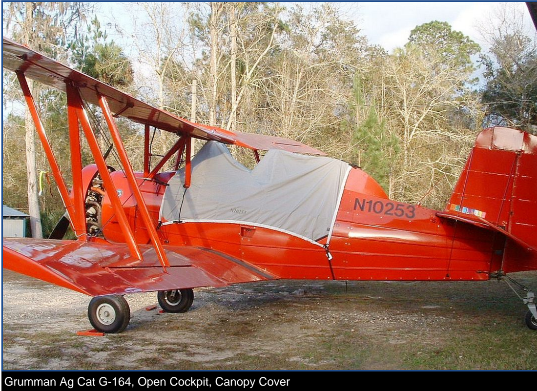
Grumman Ag Cat G-164, Open Cockpit, Canopy Cover