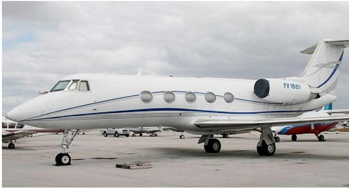
Grumman Gulfstream G-IV SP Engine Cover, bikini type Gulfstream G2 Intake Covers (Come in colors) & Cockpit HeatShield Set