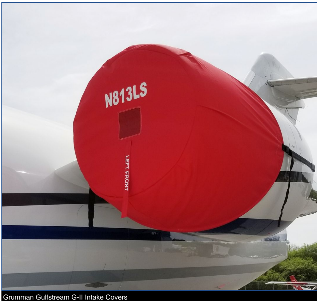
Grumman Gulfstream G-II Intake Covers