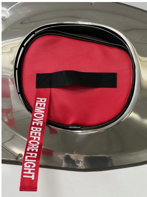
Gulfstream V APU Exhaust Plug