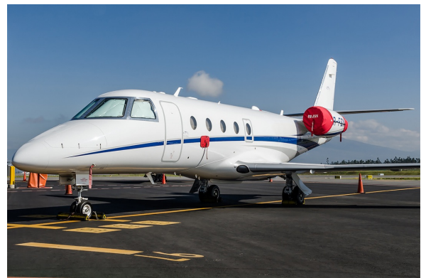
Gulfstream G150 Engine Covers, Cockpit HeatShields