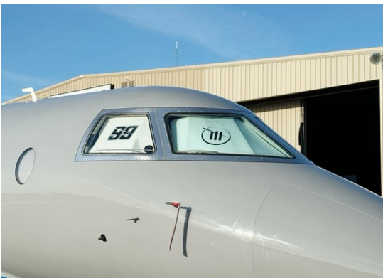
Gulfstream G200 Cockpit Heatshields

Cockpit Heatshields are interior sunshades for the aircraft's cockpit. The product is a unique composite of closed-cell foam with a silver mylar finish. The semi-rigid design is stiff enough to stand inside the window framing. The set folds up flat and is easily stored in the included storage sleeve. Some designs may require velcro and suction cups. Our Heatshields for jets are offered white side out because some aircraft manufacturers have issued advisories against reflective window inserts due to potential heat damage. A Heatshield is an excellent short-term remedy for cockpit overheating, but an external fabric cover is more effective for long-term protection.