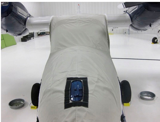
Grumman Widgeon Cockpit/Nose Cover, tie-down cleat detail