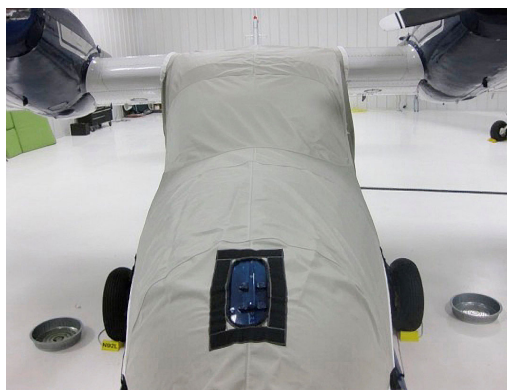
Grumman Widgeon Cockpit/Nose Cover, tie-down cleat detail