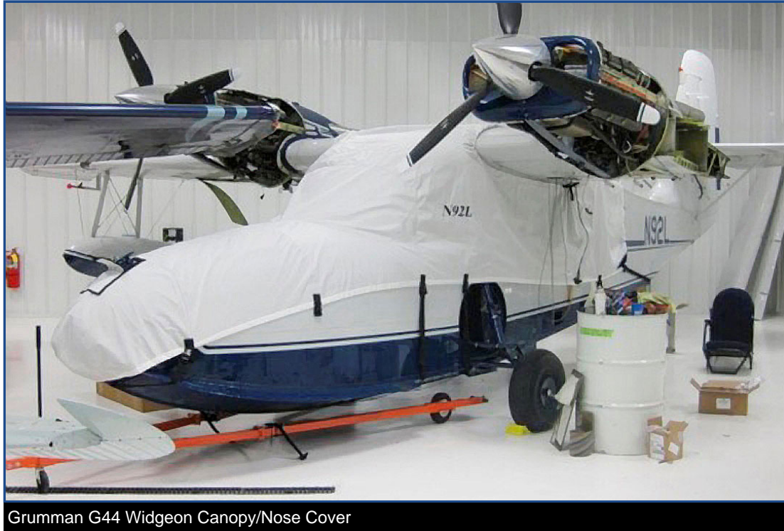
Grumman G44 Widgeon Canopy/Nose Cover