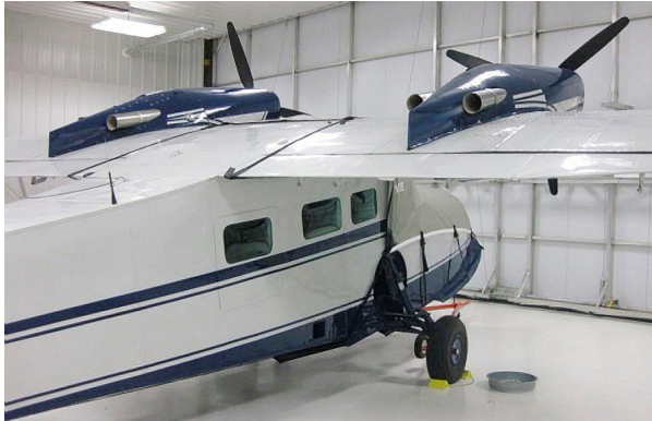
Grumman G44 Widgeon Cockpit/Nose Cover

This cover type is made from Silver Acrylic Sunbrella canvas and is 100% lined with a soft and smooth microfiber. Bruce's Custom Covers developed this material combination especially for aircraft protection. The outer material is medium weight and treated for water resistance, UV resistance and anti-static buildup. The inner lining is a very soft and smooth microfiber to prevent scratching. The material is very reflective, and tests show that the cabin interior temperature can be reduced to near-ambient temperature on the hottest of days. It is water, ice and snow repellent, yet breathable to allow moisture to escape from between the cover and the aircraft surface.