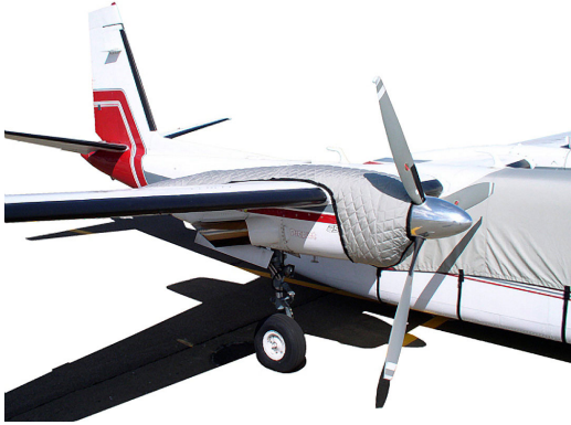
Aero Commander Insulated Engine Cover

The material is very reflective, and tests show that the cabin interior temperature can be reduced to near-ambient temperature on the hottest of days. It is water, ice and snow repellent, yet breathable to allow moisture to escape from between the cover and the aircraft surface.