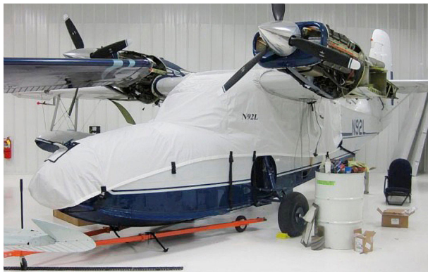
Grumman G44 Widgeon Canopy/Nose Cover

Travel Covers are made with Silver Solution-Dyed Polyester fabric and only lined over the windshield to save weight. The material is lightweight and more compact for easy stowage in the aircraft. The polyester material is water resistant, but only intended for occasional use outside. We also have an ultra lightweight material available for fitted hangar dust covers. For daily outdoor use, the non-travel Sunbrella Cover is the best choice.