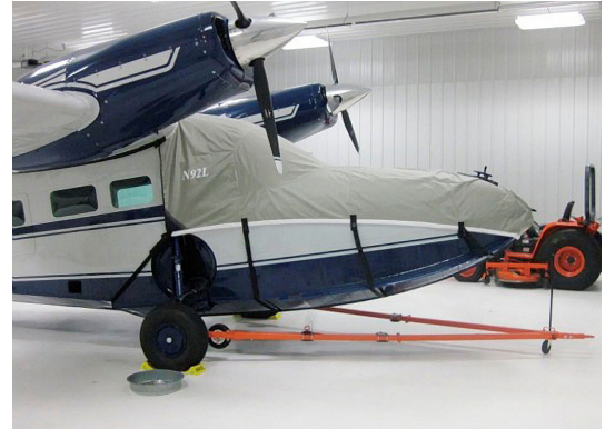
Grumman G44 Widgeon Cockpit/Nose Cover