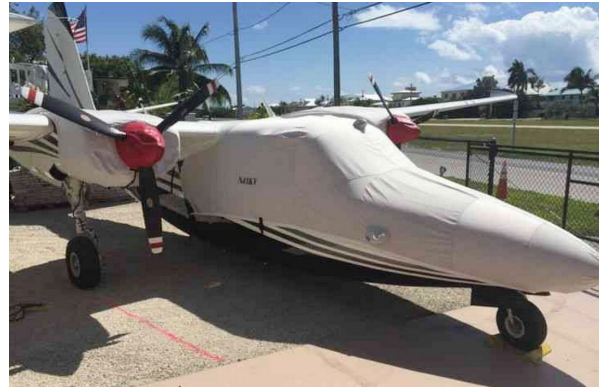
Twin Commander 560F Canopy/Nose & Engine Covers