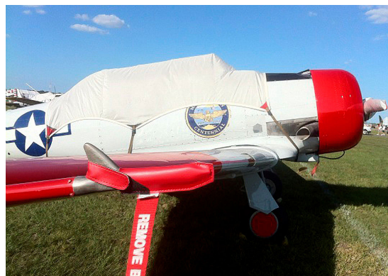
T6 Pitot, Canopy & Prop Covers

Grumman Widgeon G-44 Pitot Tube Covers , NOT HEAT RESISTANT TYPE, are made of Naugahyde vinyl, and are designed to cover the entire pitot assembly. Slipping over the tube, the cover tightens around the base with a Velcro strap detail. A "Remove Before Flight" streamer is attached to the cover. Heat Resistant Pitot Covers are an upgrade to this design, and help prevent the pitot cover from melting onto the tube if the pitot heat is accidentally turned on while installed. If you want the set tethered together, please let us know.