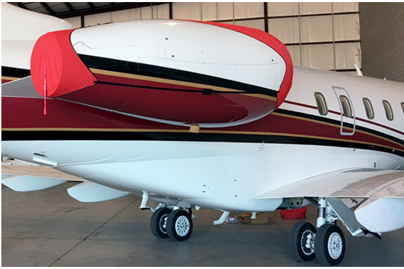
Intake/Exhaust Covers, 3-Strap Type. Successfully installed by two crew, one ladder.