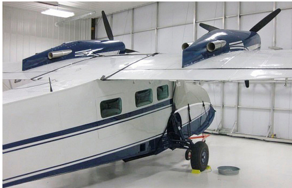
Grumman G44 Widgeon Cockpit/Nose Cover

Canopy Covers are commonly referred to as Cabin Covers, Fuselage Covers, Canvas Covers, Canopy Caps, etc.