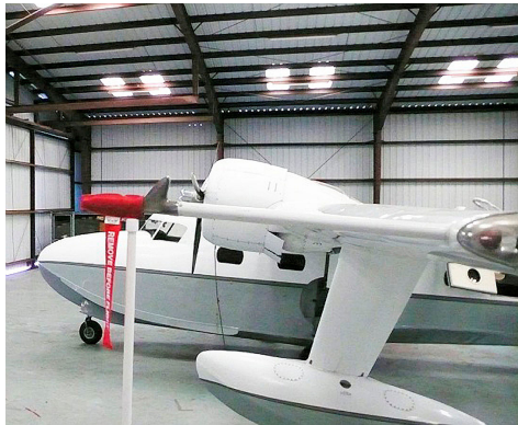
Grumman Mallard Pitot Cover with Install Tool