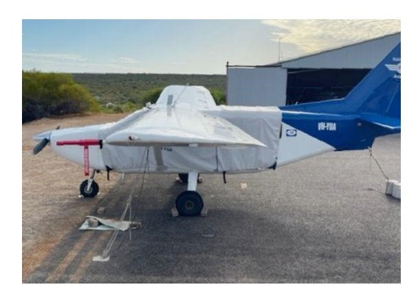
Gippsland GA-8 Extended Canopy Cover

This cover type is made from Silver Acrylic Sunbrella canvas and is 100% lined with a soft and smooth microfiber. Bruce's Custom Covers developed this material combination especially for aircraft protection. The outer material is medium weight and treated for water resistance, UV resistance and anti-static buildup. The inner lining is a very soft and smooth microfiber to prevent scratching. The material is very reflective, and tests show that the cabin interior temperature can be reduced to near-ambient temperature on the hottest of days. It is water, ice and snow repellent, yet breathable to allow moisture to escape from between the cover and the aircraft surface.