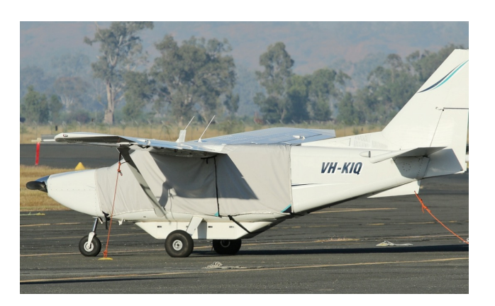
Gippsland GA-8 Airvan Extended Canopy Cover