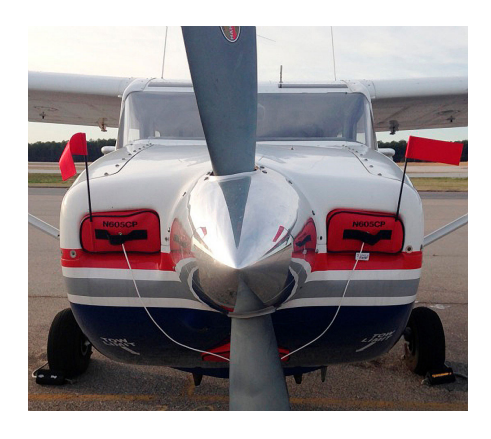
GA-8 Engine Inlet Plugs (set of 3)