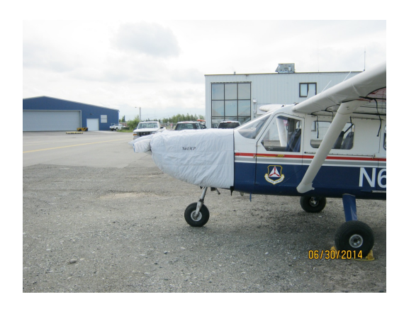
Gippsland GA-8 Airvan Insulated Engine, Wing and Prop Covers