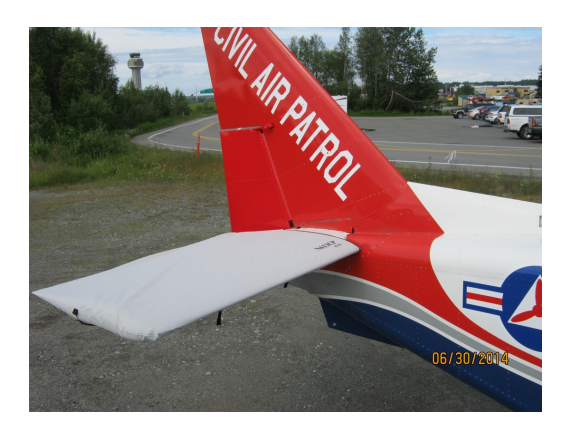
Gippsland GA-8 Airvan Horizontal Stab. Cover