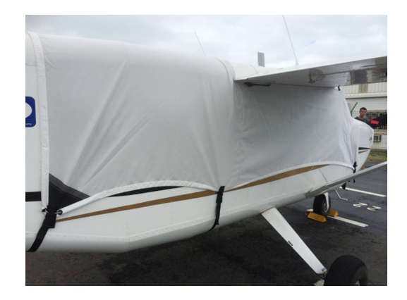
Gippsland GA-8 Airvan Canopy Cover

This cover type is made from Silver Acrylic Sunbrella canvas and is 100% lined with a soft and smooth microfiber. Bruce's Custom Covers developed this material combination especially for aircraft protection. The outer material is medium weight and treated for water resistance, UV resistance and anti-static buildup. The inner lining is a very soft and smooth microfiber to prevent scratching. The material is very reflective, and tests show that the cabin interior temperature can be reduced to near-ambient temperature on the hottest of days. It is water, ice and snow repellent, yet breathable to allow moisture to escape from between the cover and the aircraft surface.