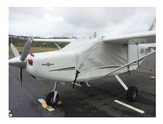
Gippsland GA-8 Airvan Canopy Cover