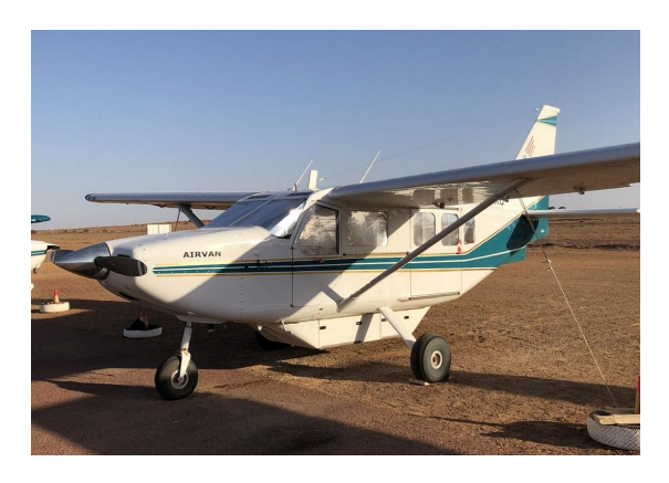
Gippsland GA-8 Airvan