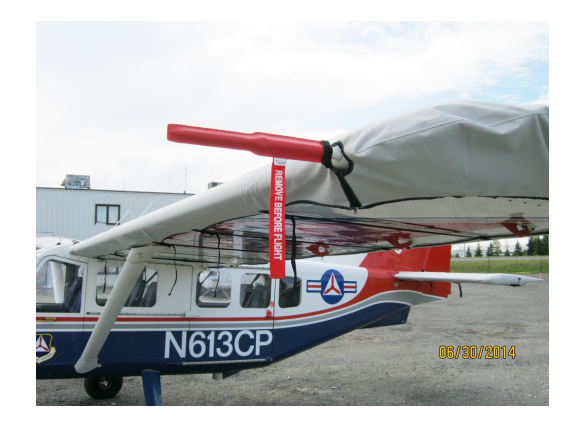
Gippsland GA-8 Airvan Wing Covers, Pitot Cover

shorter useful life if used continuously outside than the all-year use material.