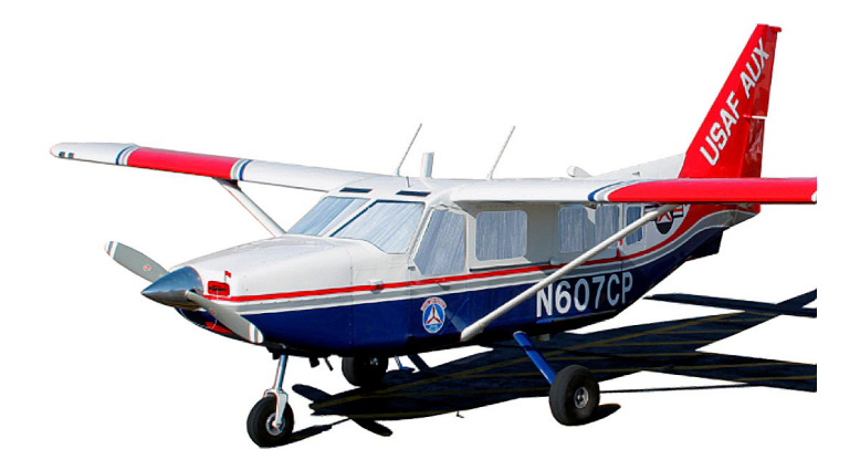
Covers, Plugs & HeatShields for the Gippsland GA-8 Airvan

Cockpit Heatshields are interior sunshades for the aircraft's cockpit. The product is a unique composite of closed-cell foam with a silver mylar finish. The semi-rigid design is stiff enough to stand inside the window framing. The set folds up flat and is easily stored in the included storage sleeve. Some designs may require velcro and suction cups. A Heatshield is an excellent short-term remedy for cockpit overheating, but an external fabric cover is more effective for long-term protection.