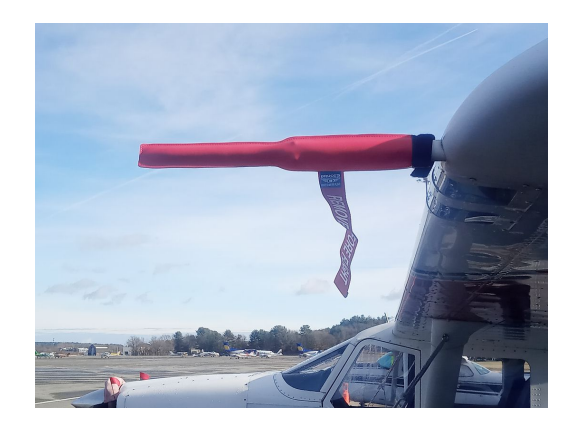
Gippsland GA-8 Airvan Pitot Cover