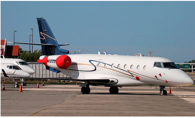
Engine Cover Set for the IAI-1126 Galaxy