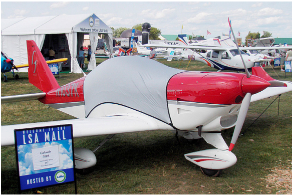
Gobosh GB7 Light Weight Travel-Cover