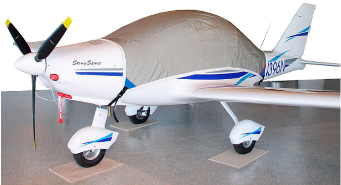
Sting Sport Canopy Cover & Engine Plugs