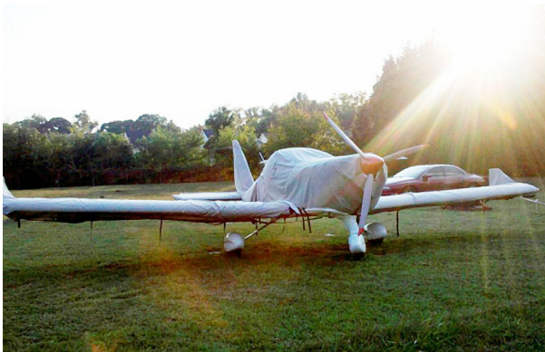
Gobosh Full Cover Set