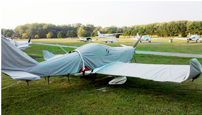
Gobosh Full Cover Set

WINTER USE MATERIAL - Made with Solution-Dyed Polyester fabric, this option is intended for seasonal use to aid in deicing, rain mitigation, or for occasional travel. The material is lighter and more compact, but more susceptible to UV damage and may have a shorter useful life if used continuously outside than the all-year use material.