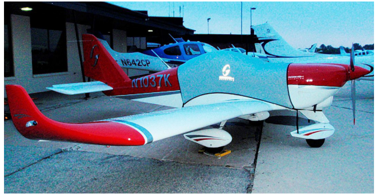
Gobosh Light Weight Travel-Cover