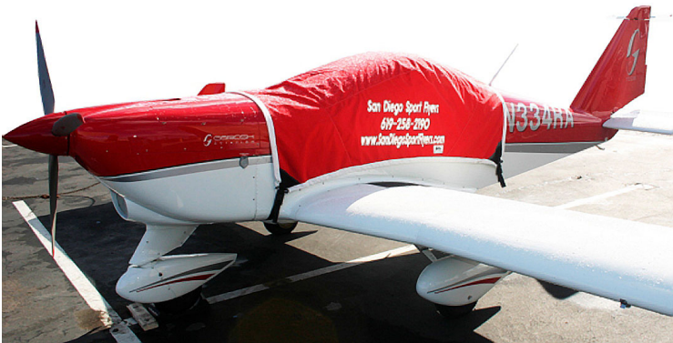
Gobosh Canopy Cover with custom Imprint

This cover type is made from Silver Acrylic Sunbrella canvas and is 100% lined with a soft and smooth microfiber. Bruce's Custom Covers developed this material combination especially for aircraft protection. The outer material is medium weight and treated for water resistance, UV resistance and anti-static buildup. The inner lining is a very soft and smooth microfiber to prevent scratching. The material is very reflective, and tests show that the cabin interior temperature can be reduced to near-ambient temperature on the hottest of days. It is water, ice and snow repellent, yet breathable to allow moisture to escape from between the cover and the aircraft surface.