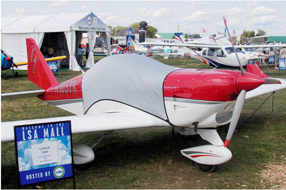
Gobosh GB7 Light Weight Travel-Cover

Travel Covers are made with Silver Solution-Dyed Polyester fabric and only lined over the windshield to save weight. The material is lightweight and more compact for easy stowage in the aircraft. The polyester material is water resistant, but only intended for occasional use outside. We also have an ultra lightweight material available for fitted hangar dust covers. For daily outdoor use, the non-travel Sunbrella Cover is the best choice.