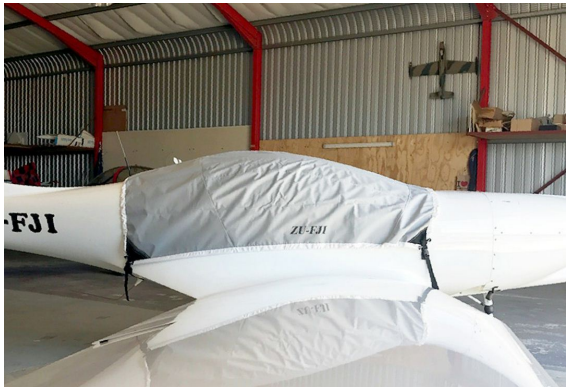
Gobosh 800XP Travel Cover, Light Weight Travel Canopy Cover and Inlet Plugs Gobosh 800XP Travel Cover, Light Weight Travel Canopy Cover