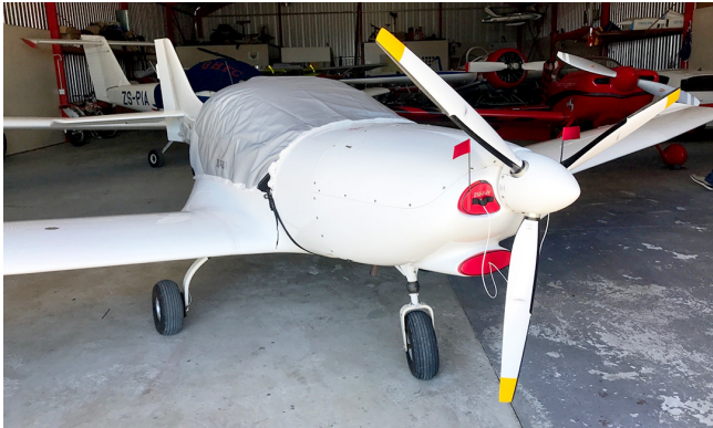
Gobosh 800XP Travel Cover, Light Weight Travel Canopy Cover and Inlet Plugs

Engine Inlet Plugs are custom fit for your Gobosh 800XP intakes, made with heavy-duty vinyl material, and stuffed with a single block of sculpted urethane foam. Each plug has a zipper that allows the foam to be removed and dried if necessary. Engine plugs have warning flags that are visible from the cockpit or 'remove before flight' streamers sewn onto the face of the plugs. Most plugs are imprinted with the aircraft registration number in black for an extra charge. Storage bag NOT included. Engine plugs may be inserted after flight when the engine is still warm. Engine Inlet Plugs are commonly referred to as Cowl Plugs, Intake Plugs, Cowl Blocks, Engine Blocks, and Engine Bungs.