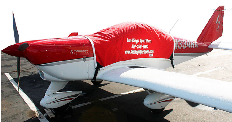
Gobosh Canopy Cover with custom Imprint

This cover type is made from Silver Acrylic Sunbrella canvas and is 100% lined with a soft and smooth microfiber. Bruce's Custom Covers developed this material combination especially for aircraft protection. The outer material is medium weight and treated for water resistance, UV resistance and anti-static buildup. The inner lining is a very soft and smooth microfiber to prevent scratching. The material is very reflective, and tests show that the cabin interior temperature can be reduced to near-ambient temperature on the hottest of days. It is water, ice and snow repellent, yet breathable to allow moisture to escape from between the cover and the aircraft surface.