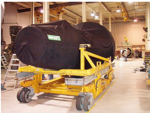
GE CF-6 QEC Engine Long-term Storage/Transport Cover "Bag" (Boeing 767)