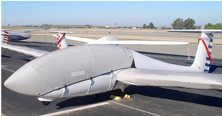
Grob 103 Canopy/Nose Cover and Wing Covers