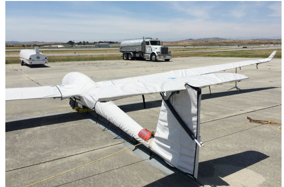
Schemp-Hirth Discus 2B Full Cover Set