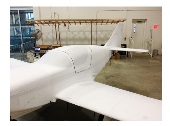
Glasair 2 Complete Fuselage/Wings Cover, test fit cover

This cover type is made from Silver Acrylic Sunbrella canvas and is 100% lined with a soft and smooth microfiber. Bruce's Custom Covers developed this material combination especially for aircraft protection. The outer material is medium weight and treated for water resistance, UV resistance and anti-static buildup. The inner lining is a very soft and smooth microfiber to prevent scratching. The material is very reflective, and tests show that the cabin interior temperature can be reduced to near-ambient temperature on the hottest of days. It is water, ice and snow repellent, yet breathable to allow moisture to escape from between the cover and the aircraft surface.