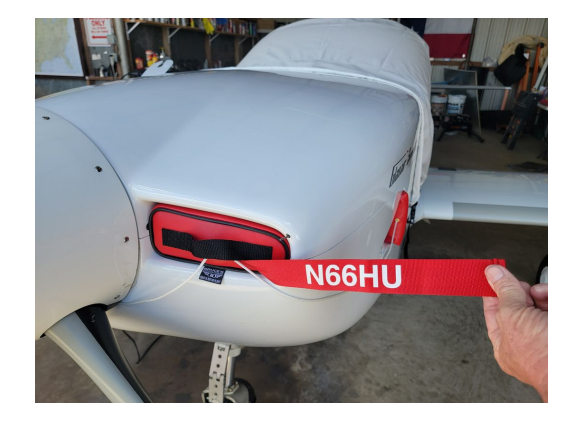
GLASAIR S2-RG Canopy Cover, Engine Plugs

Engine Inlet Plugs are custom fit for your Glasair Aviation Glasair II & III intakes, made with heavy-duty vinyl material, and stuffed with a single block of sculpted urethane foam. Each plug has a zipper that allows the foam to be removed and dried if necessary. Engine plugs have warning flags that are visible from the cockpit or 'remove before flight' streamers sewn onto the face of the plugs. Most plugs are imprinted with the aircraft registration number in black for an extra charge. Storage bag NOT included. Engine plugs may be inserted after flight when the engine is still warm. Engine Inlet Plugs are commonly referred to as Cowl Plugs, Intake Plugs, Cowl Blocks, Engine Blocks, and Engine Bungs.