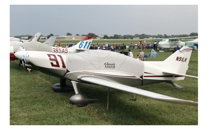
Glasair II Canopy Cover