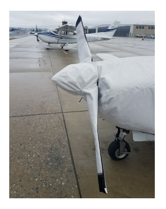
Glasair Aviation Glasair II & III Propellor/Spinner Cover, 2 Blade