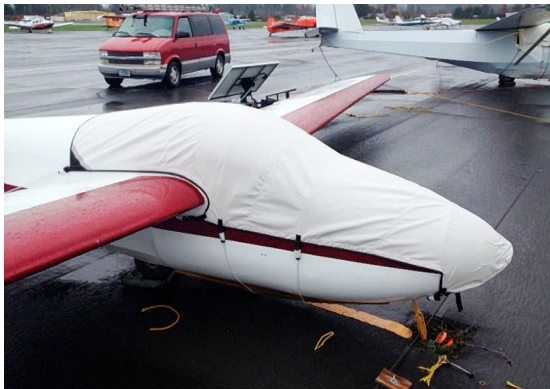
SGS 1-26B Canopy/Nose Cover

water resistance, UV resistance and anti-static buildup. The inner lining is a very soft and smooth microfiber to prevent scratching. The material is very reflective, and tests show that the cabin interior temperature can be reduced to near-ambient temperature on the hottest of days. It is water, ice and snow repellent, yet breathable to allow moisture to escape from between the cover and the aircraft surface.