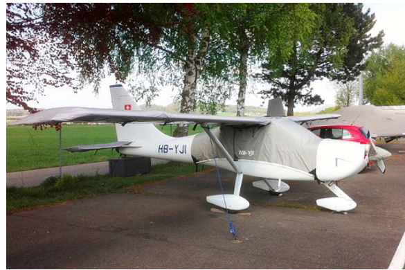
OMF Symphony Canopy, Wings, Horiz. Stab, and Prop Covers