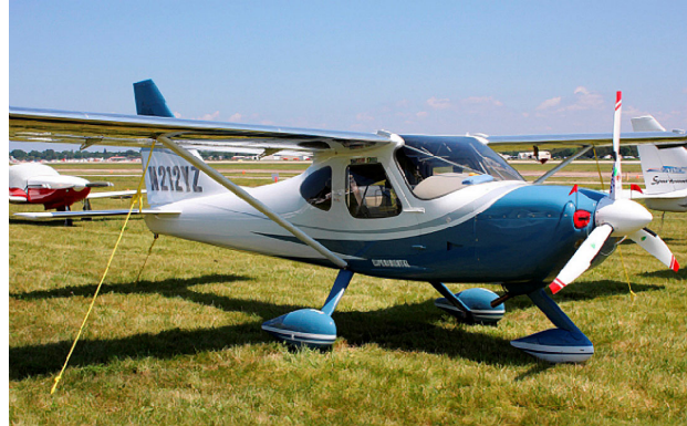
Glastar Sportsman Engine Inlet Plugs