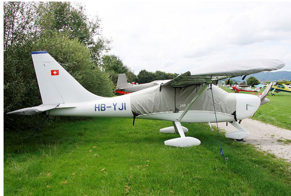
Glastar Canopy, Wings, Horizontal Stab. & Prop Covers

WINTER USE MATERIAL - Made with Solution-Dyed Polyester fabric, this option is intended for seasonal use to aid in deicing, rain mitigation, or for occasional travel. The material is lighter and more compact, but more susceptible to UV damage and may have a shorter useful life if used continuously outside than the all-year use material.