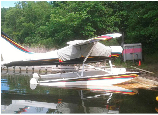
Glstar Sportsman Canopy Cover