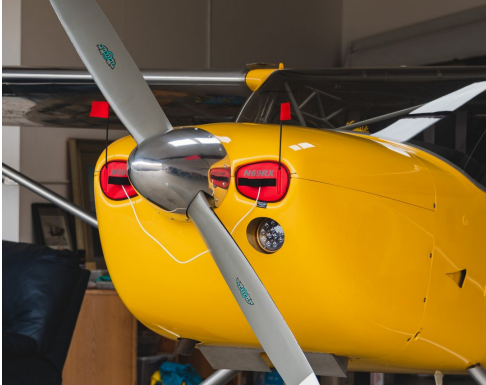
Glastar Engine Inlet Plugs

Engine Inlet Plugs are custom fit for your Glasair Aviation Glastar, Sportsman 2+2 intakes, made with heavy-duty vinyl material, and stuffed with a single block of sculpted urethane foam. Each plug has a zipper that allows the foam to be removed and dried if necessary. Engine plugs have warning flags that are visible from the cockpit or 'remove before flight' streamers sewn onto the face of the plugs. Most plugs are imprinted with the aircraft registration number in black for an extra charge. Storage bag NOT included. Engine plugs may be inserted after flight when the engine is still warm. Engine Inlet Plugs are commonly referred to as Cowl Plugs, Intake Plugs, Cowl Blocks, Engine Blocks, and Engine Bungs.