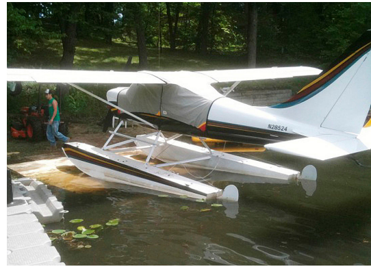
Glstar Sportsman Canopy Cover