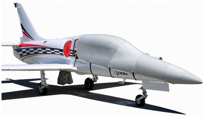
L39 Canopy/Nose Cover & Intake Plugs

Covers developed this material combination especially for aircraft protection. The outer material is medium weight and treated for water resistance, UV resistance and anti-static buildup. The inner lining is a very soft and smooth microfiber to prevent scratching. The material is very reflective, and tests show that the cabin interior temperature can be reduced to near-ambient temperature on the hottest of days. It is water, ice and snow repellent, yet breathable to allow moisture to escape from between the cover and the aircraft surface.