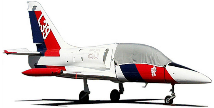
Canopy Cover for Aero L-39 Albatros