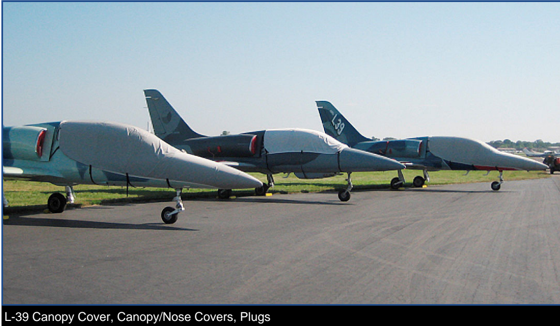
L-39 Canopy Cover, Canopy/Nose Covers, Plugs