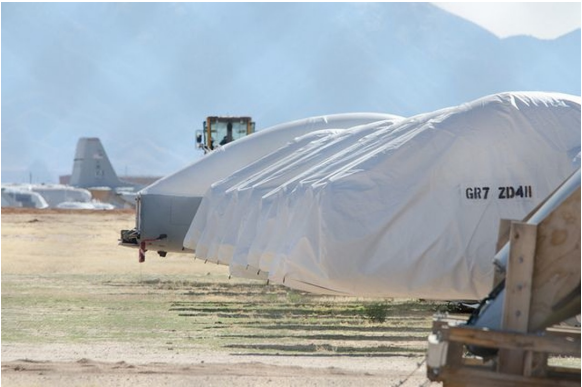
GR-7/9 FULL FUSELAGE COVER , NSN's: 1730-01-600-4557 GR-7/9 FULL FUSELAGE COVER , NSN's: 1730-01-600-4557 & 1730-01-600-6757, single seat