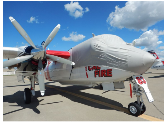
Grumman Tracker Canopy/Nose Cover