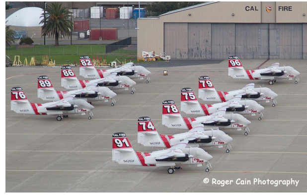
Grumman S-2 Tracker Canopy/Nose Cover