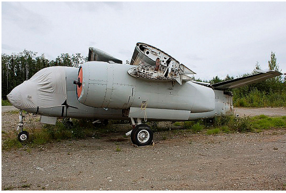
Grumman Tracker Canopy/Nose Cover