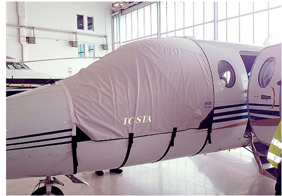
Beechjet 400A Cockpit Cover