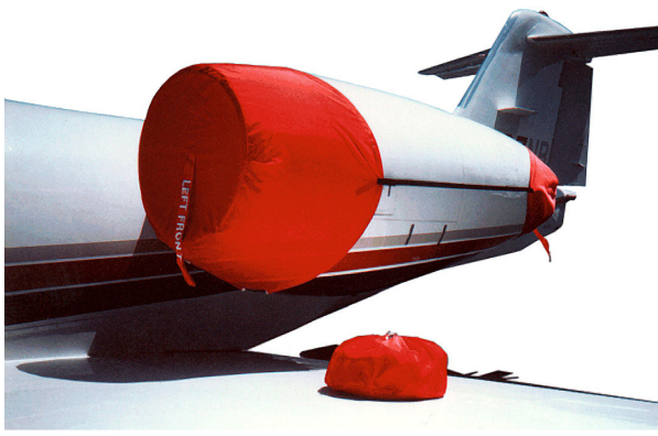
Lear 35 Engine Covers