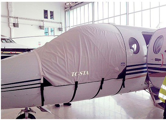
Beechjet 400A Cockpit Cover