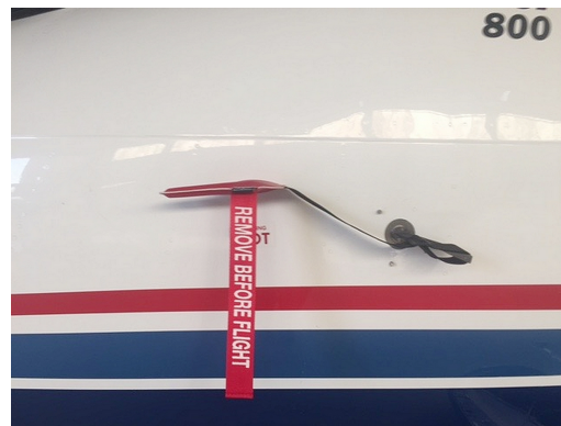
Hawker Beechcraft 800, 800XP, 850XP Pitot Covers With Aoa Straps

The Engine Inlet Plugs are custom fit for your British Aerospace Hawker 700 intakes, made with heavy-duty vinyl material, and stuffed with a single block of sculpted urethane foam. Each plug has a zipper that allows the foam to be removed and dried if necessary. Engine plugs have 'remove before flight' streamers sewn onto the face of the plugs. Most plugs are imprinted with the aircraft registration number in black for an extra charge. Storage bag NOT included. Engine plugs may be inserted after flight when the engine is still warm. Engine Inlet Plugs are commonly referred to as Cowl Plugs, Intake Plugs, Cowl Blocks, Engine Blocks, and Engine Bungs.