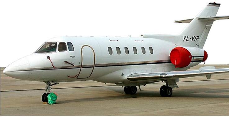
Hawker 700 Tri-Fold Engine Covers