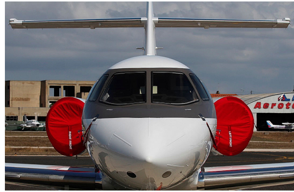
Hawker 750 Engine Intake Covers