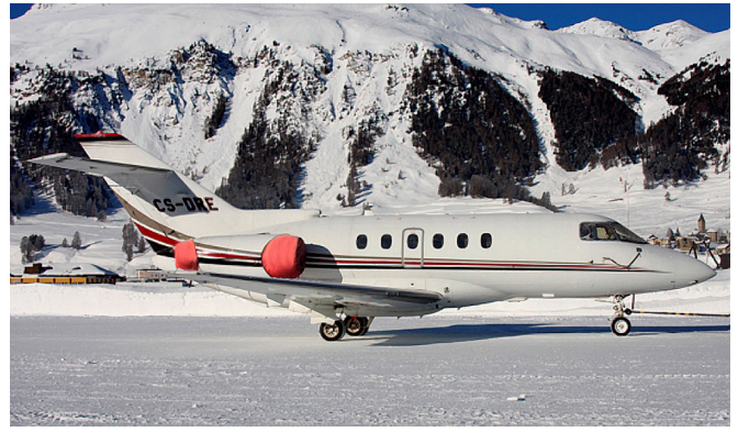
Hawker 800XP Tri-Fold Engine Intake/Exhaust Cover Set