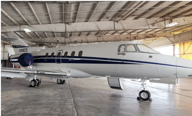
Hawker 750 HeatShields & Engine Covers

Cockpit Heatshields are interior sunshades for the aircraft's cockpit. The product is a unique composite of closed-cell foam with a silver mylar finish. The semi-rigid design is stiff enough to stand inside the window framing. The set folds up flat and is easily stored in the included storage sleeve. Some designs may require velcro and suction cups. Our Heatshields for jets are offered white side out because some aircraft manufacturers have issued advisories against reflective window inserts due to potential heat damage. A Heatshield is an excellent short-term remedy for cockpit overheating, but an external fabric cover is more effective for long-term protection.