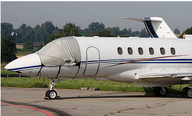
Hawker 800 Cockpit Cover