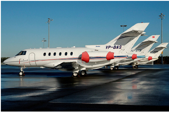
Hawker 800XP Tri-Fold Engine Intake/Exhaust Cover Set & Pitot AOA Cover Set