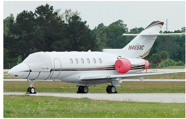
Hawker 800 Cockpit Cover and Engine Covers set