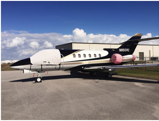
Hawker 800 Cockpit Cover, extended aft 24"