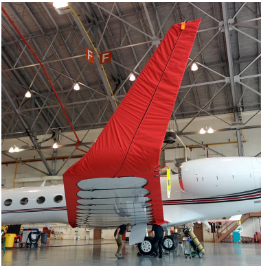
Gulfstream G550 Wing/Winglet Covers

WINTER USE MATERIAL - Made with Solution-Dyed Polyester fabric, this option is intended for seasonal use to aid in deicing, rain mitigation, or for occasional travel. The material is lighter and more compact, but more susceptible to UV damage and may have a shorter useful life if used continuously outside than the all-year use material.