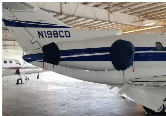
Hawker 750 Engine Covers