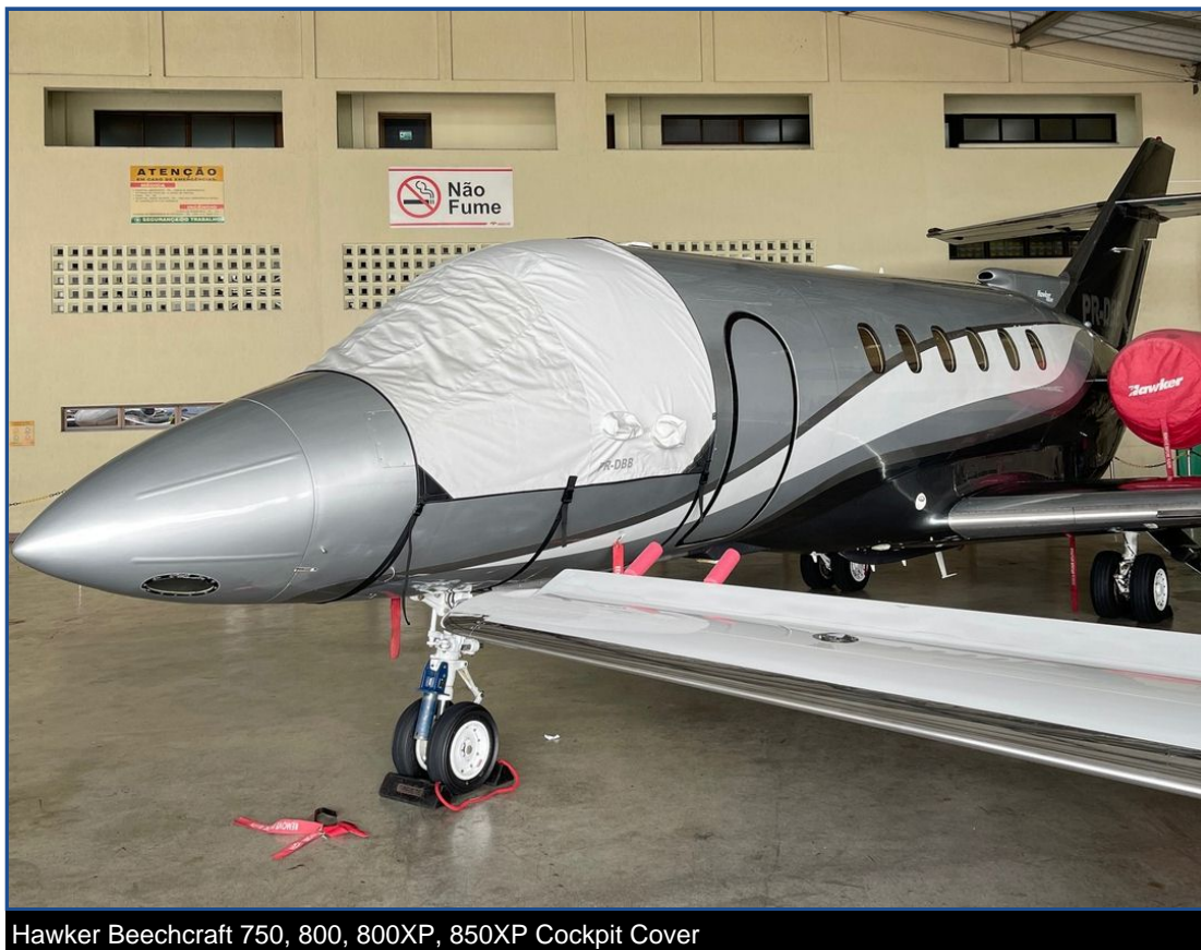
Hawker Beechcraft 750, 800, 800XP, 850XP Cockpit Cover