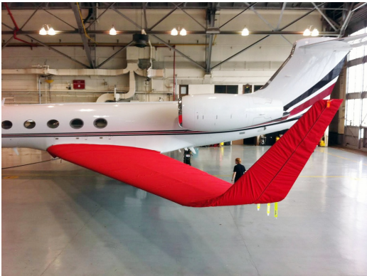
Gulfstream G550 Wing/Winglet Covers