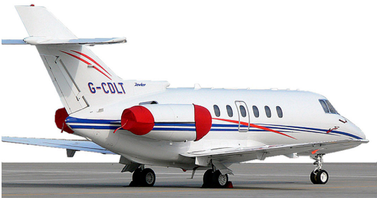
Hawker 800 Tri-Fold Engine Covers