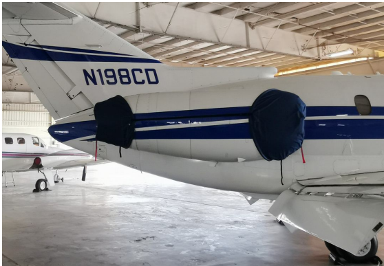
Hawker 750 Engine Covers