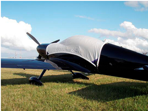
Harmon Rocket Canopy Cover

Travel Covers are made with Silver Solution-Dyed Polyester fabric and only lined over the windshield to save weight. The material is lightweight and more compact for easy stowage in the aircraft. The polyester material is water resistant, but only intended for occasional use outside. We also have an ultra lightweight material available for fitted hangar dust covers. For daily outdoor use, the non-travel Sunbrella Cover is the best choice.