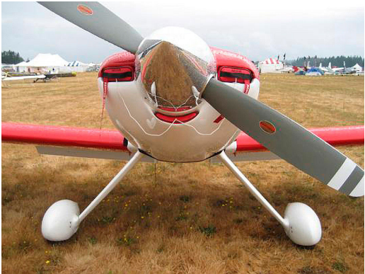
Harmon Rocket Engine Inlet Plugs

Engine Inlet Plugs are custom fit for your Harmon Rocket intakes, made with heavy-duty vinyl material, and stuffed with a single block of sculpted urethane foam. Each plug has a zipper that allows the foam to be removed and dried if necessary. Engine plugs have warning flags that are visible from the cockpit or 'remove before flight' streamers sewn onto the face of the plugs. Most plugs are imprinted with the aircraft registration number in black for an extra charge. Storage bag NOT included. Engine plugs may be inserted after flight when the engine is still warm. Engine Inlet Plugs are commonly referred to as Cowl Plugs, Intake Plugs, Cowl Blocks, Engine Blocks, and Engine Bungs.