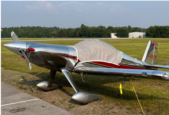
Harmon Rocket Travel Light Weight Canopy Cover Std Windshield