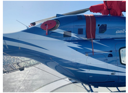
Bell 429 Exhaust Plug, Rotor Mast Cover