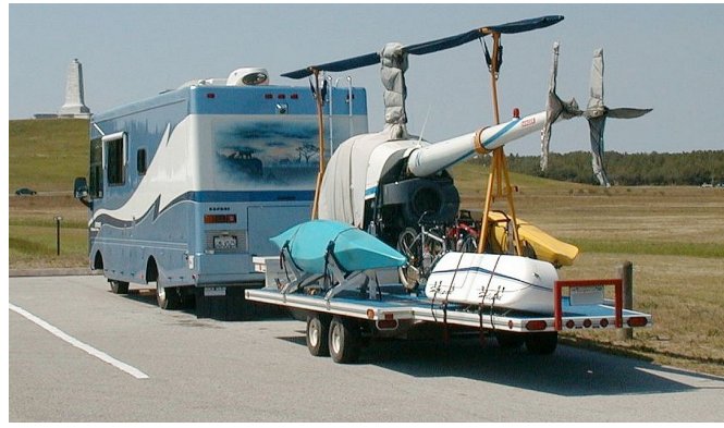
Robinson R-22 Bubble, Rotor Mast, Blades, Tail Rotor & Stabilizer Covers