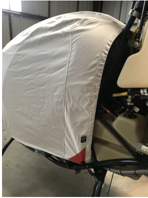
Helicycle Bubble Cover

This cover type is made from Silver Acrylic Sunbrella canvas and is 100% lined with a soft and smooth microfiber. Bruce's Custom Covers developed this material combination especially for aircraft protection. The outer material is medium weight and treated for water resistance, UV resistance and anti-static buildup. The inner lining is a very soft and smooth microfiber to prevent scratching. The material is very reflective, and tests show that the cabin interior temperature can be reduced to near-ambient temperature on the hottest of days. It is water, ice and snow repellent, yet breathable to allow moisture to escape from between the cover and the aircraft surface.