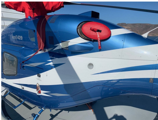
Bell 429 Exhaust Plug

The Engine Exhaust Plugs are custom fit for your Eagle R&D Helicycle exhaust openings, made with heavy-duty vinyl material, and stuffed with a single block of sculpted urethane foam. Exhaust plugs have 'Remove Before Flight' streamers sewn onto the face of the plugs. Exhaust plugs may be inserted soon after flight when the engine is still warm. Engine Inlet Plugs are commonly referred to as Cowl Plugs, Intake Plugs, Cowl Blocks, Engine Blocks, and Engine Bungs.