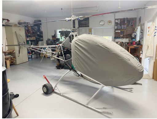
Eagle Helicycle Bubble Cover