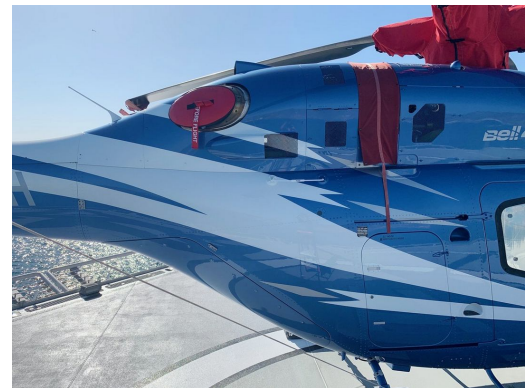
Bell 429 Exhaust Plug, Rotor Mast Cover