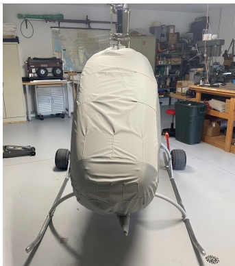
Eagle Helicycle Bubble Cover

This cover type is made from Silver Acrylic Sunbrella canvas and is 100% lined with a soft and smooth microfiber. Bruce's Custom Covers developed this material combination especially for aircraft protection. The outer material is medium weight and treated for water resistance, UV resistance and anti-static buildup. The inner lining is a very soft and smooth microfiber to prevent scratching. The material is very reflective, and tests show that the cabin interior temperature can be reduced to near-ambient temperature on the hottest of days. It is water, ice and snow repellent, yet breathable to allow moisture to escape from between the cover and the aircraft surface.