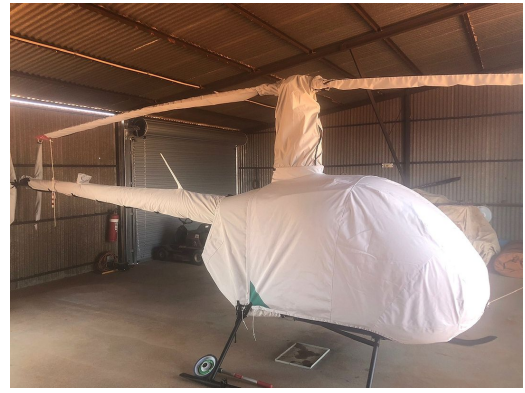
Robinson R-22 Full Cover Set