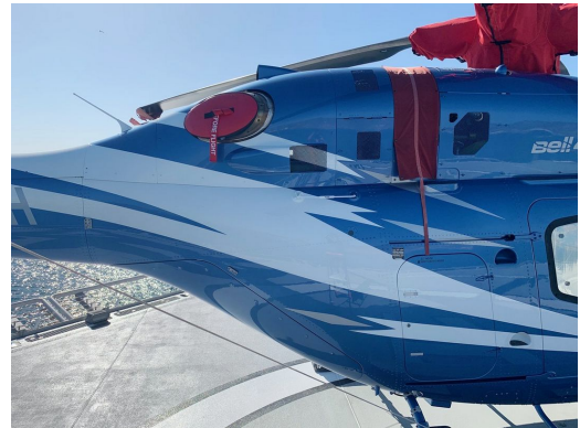
Bell 429 Exhaust Plug, Rotor Mast Cover