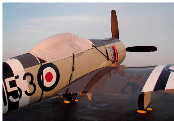
Sea Fury Canopy Cover & Exhaust Plugs