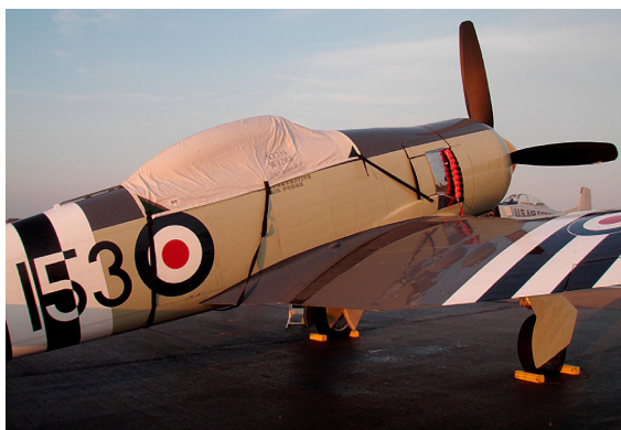
Sea Fury Canopy Cover & Exhaust Plugs