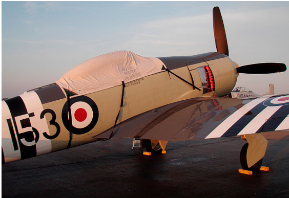
Sea Fury Canopy Cover & Exhaust Plugs

This cover type is made from Silver Acrylic Sunbrella canvas and is 100% lined with a soft and smooth microfiber. Bruce's Custom Covers developed this material combination especially for aircraft protection. The outer material is medium weight and treated for water resistance, UV resistance and anti-static buildup. The inner lining is a very soft and smooth microfiber to prevent scratching. The material is very reflective, and tests show that the cabin interior temperature can be reduced to near-ambient temperature on the hottest of days. It is water, ice and snow repellent, yet breathable to allow moisture to escape from between the cover and the aircraft surface.