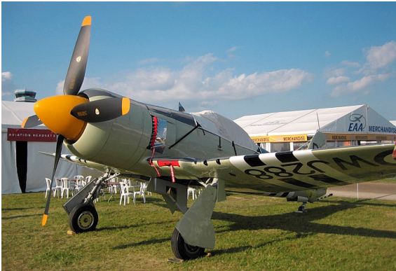
Hawker Sea Fury Canopy Cover, Exhaust Plugs, Wingroot Inlet Plugs