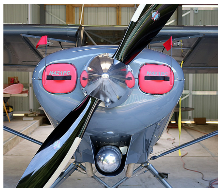
Piper PA-18 Super Cub Engine Inlet Plugs

Engine Inlet Plugs are custom fit for your Hatz Biplane CB-1 intakes, made with heavy-duty vinyl material, and stuffed with a single block of sculpted urethane foam. Each plug has a zipper that allows the foam to be removed and dried if necessary. Engine plugs have warning flags that are visible from the cockpit or 'remove before flight' streamers sewn onto the face of the plugs. Most plugs are imprinted with the aircraft registration number in black for an extra charge. Storage bag NOT included. Engine plugs may be inserted after flight when the engine is still warm. Engine Inlet Plugs are commonly referred to as Cowl Plugs, Intake Plugs, Cowl Blocks, Engine Blocks, and Engine Bungs.