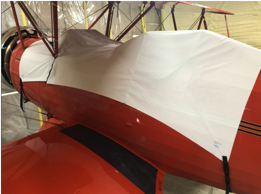
Hatz Biplane Canopy Cover, test fit cover

This cover type is made from Silver Acrylic Sunbrella canvas and is 100% lined with a soft and smooth microfiber. Bruce's Custom Covers developed this material combination especially for aircraft protection. The outer material is medium weight and treated for water resistance, UV resistance and anti-static buildup. The inner lining is a very soft and smooth microfiber to prevent scratching. The material is very reflective, and tests show that the cabin interior temperature can be reduced to near-ambient temperature on the hottest of days. It is water, ice and snow repellent, yet breathable to allow moisture to escape from between the cover and the aircraft surface.