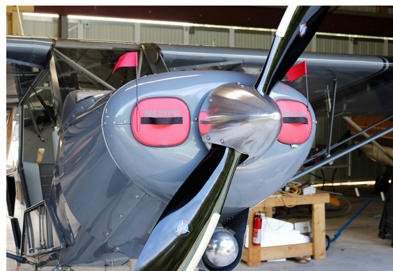
Piper PA-18 Super Cub Engine Inlet Plugs