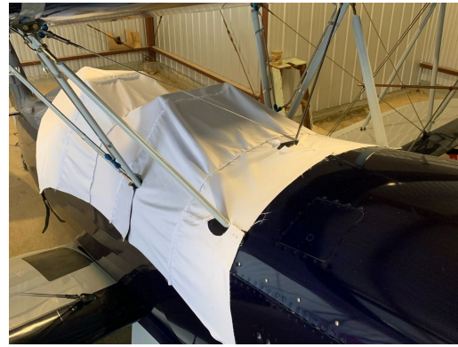
Hatz Biplane Canopy Cover, test fit cover