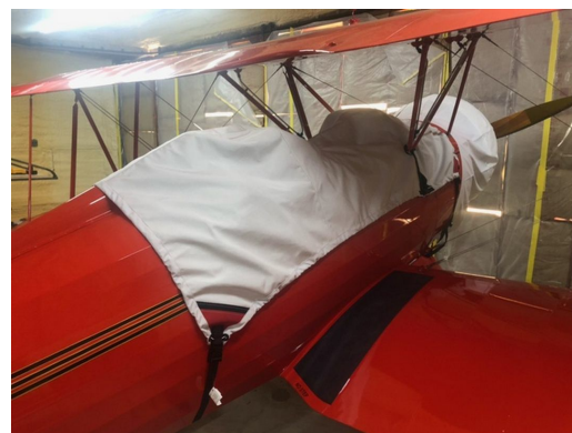
Hatz CB-1 Biplane Canopy & Engine Covers