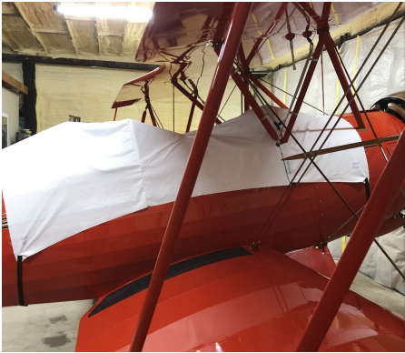
Hatz Biplane Canopy Cover, test fit cover