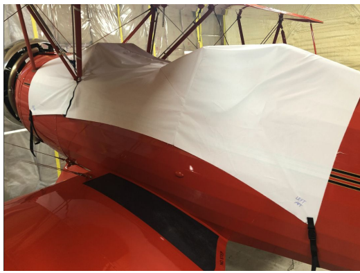
Hatz Biplane Canopy Cover, test fit cover