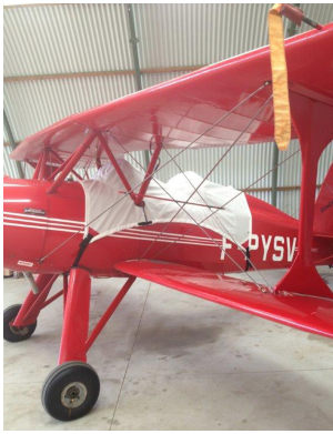
Starduster Too Canopy Cover