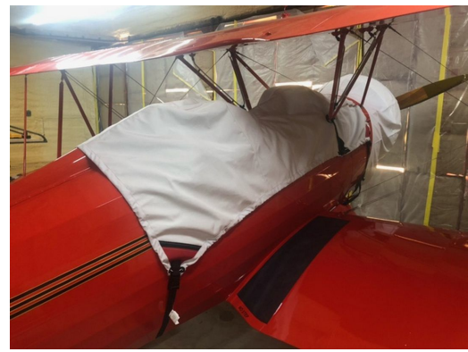
Hatz CB-1 Biplane Canopy & Engine Covers