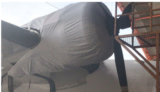
Grumman HU-16 Albatross Engine Cover (test fit cover)