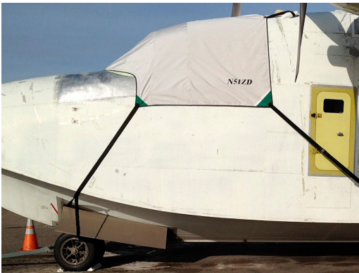
Grumman HU-16 Albatross Canopy Cover

This cover type is made from Silver Acrylic Sunbrella canvas and is 100% lined with a soft and smooth microfiber. Bruce's Custom Covers developed this material combination especially for aircraft protection. The outer material is medium weight and treated for water resistance, UV resistance and anti-static buildup. The inner lining is a very soft and smooth microfiber to prevent scratching. The material is very reflective, and tests show that the cabin interior temperature can be reduced to near-ambient temperature on the hottest of days. It is water, ice and snow repellent, yet breathable to allow moisture to escape from between the cover and the aircraft surface.