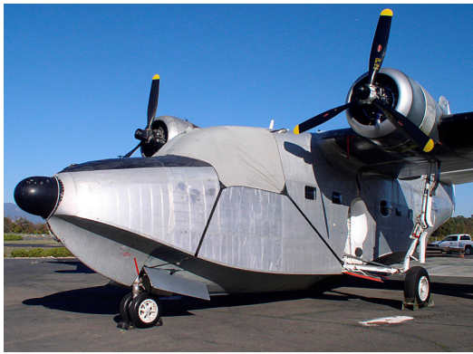
Canopy Cover for the Grumman HU-16 Albatross

This cover type is made from Silver Acrylic Sunbrella canvas and is 100% lined with a soft and smooth microfiber. Bruce's Custom Covers developed this material combination especially for aircraft protection. The outer material is medium weight and treated for water resistance, UV resistance and anti-static buildup. The inner lining is a very soft and smooth microfiber to prevent scratching. The material is very reflective, and tests show that the cabin interior temperature can be reduced to near-ambient temperature on the hottest of days. It is water, ice and snow repellent, yet breathable to allow moisture to escape from between the cover and the aircraft surface.