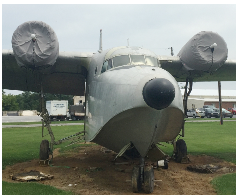
Grumman Albatross Engine Covers

This cover type is made from Silver Acrylic Sunbrella canvas and is 100% lined with a soft and smooth microfiber. Bruce's Custom Covers developed this material combination especially for aircraft protection. The outer material is medium weight and treated for water resistance, UV resistance and anti-static buildup. The inner lining is a very soft and smooth microfiber to prevent scratching. The material is very reflective, and tests show that the cabin interior temperature can be reduced to near-ambient temperature on the hottest of days. It is water, ice and snow repellent, yet breathable to allow moisture to escape from between the cover and the aircraft surface.