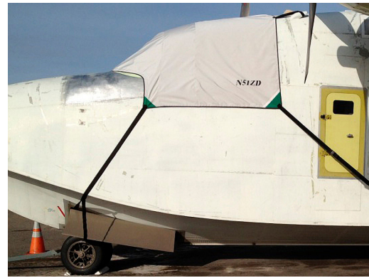
Grumman HU-16 Albatross Canopy Cover