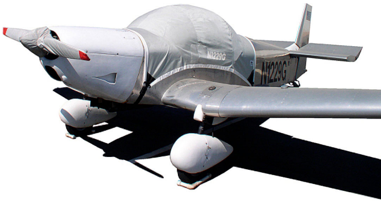
Zenith CH601 Canopy Cover & Prop Cover