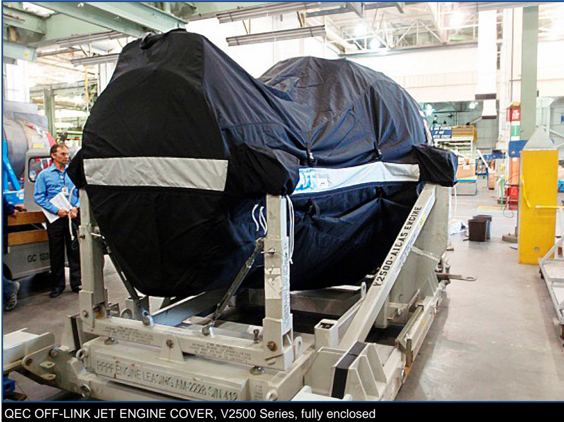
QEC OFF-LINK JET ENGINE COVER, V2500 Series, fully enclosed