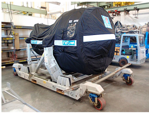
QEC OFF-LINK JET ENGINE COVER, V2500 Series, fully enclosed