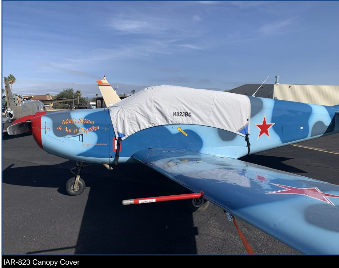
IAR-823 Canopy Cover