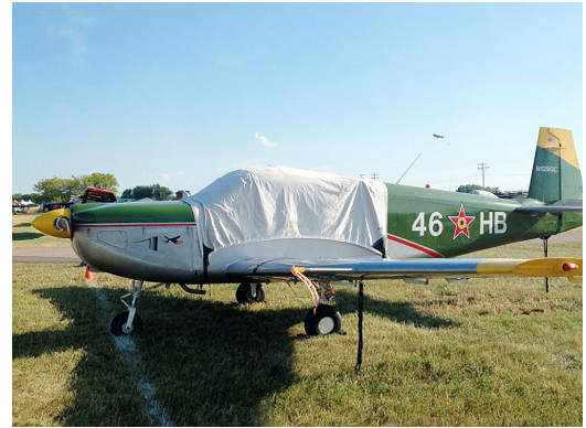
IAR Canopy Cover