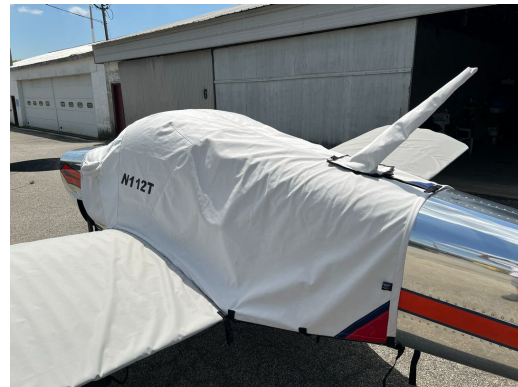
Thorp Sky Scooter Extended Canopy Cover & Wing Covers