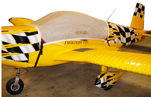
Indus Thorpedo Canopy Cover

This cover type is made from Silver Acrylic Sunbrella canvas and is 100% lined with a soft and smooth microfiber. Bruce's Custom Covers developed this material combination especially for aircraft protection. The outer material is medium weight and treated for water resistance, UV resistance and anti-static buildup. The inner lining is a very soft and smooth microfiber to prevent scratching. The material is very reflective, and tests show that the cabin interior temperature can be reduced to near-ambient temperature on the hottest of days. It is water, ice and snow repellent, yet breathable to allow moisture to escape from between the cover and the aircraft surface.