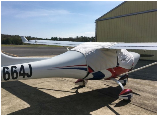
Jabiru J230-SP Canopy Cover, Over-Top Style

This cover type is made from Silver Acrylic Sunbrella canvas and is 100% lined with a soft and smooth microfiber. Bruce's Custom Covers developed this material combination especially for aircraft protection. The outer material is medium weight and treated for water resistance, UV resistance and anti-static buildup. The inner lining is a very soft and smooth microfiber to prevent scratching. The material is very reflective, and tests show that the cabin interior temperature can be reduced to near-ambient temperature on the hottest of days. It is water, ice and snow repellent, yet breathable to allow moisture to escape from between the cover and the aircraft surface.