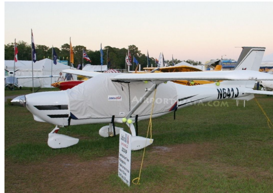
Jabiru J230 Canopy Cover