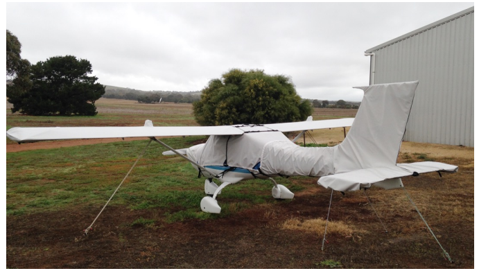
Jabiru 160 Canopy, Engine, Prop, Wings & Empennage Covers Jabiru 160 Canopy, Engine, Prop, Wings & Empennage Covers