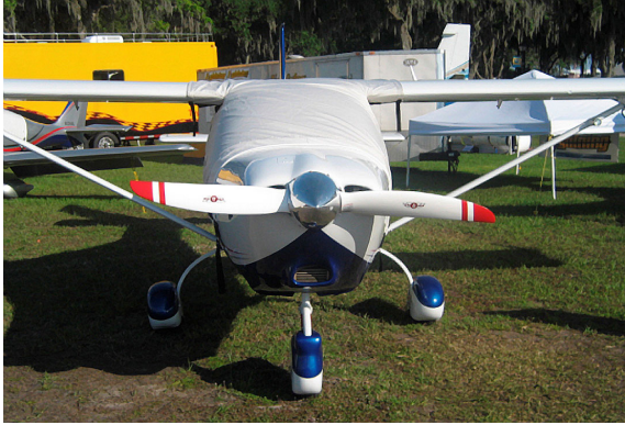
Jabiru 230-SP Canopy Cover, Over-top style

This cover type is made from Silver Acrylic Sunbrella canvas and is 100% lined with a soft and smooth microfiber. Bruce's Custom Covers developed this material combination especially for aircraft protection. The outer material is medium weight and treated for water resistance, UV resistance and anti-static buildup. The inner lining is a very soft and smooth microfiber to prevent scratching. The material is very reflective, and tests show that the cabin interior temperature can be reduced to near-ambient temperature on the hottest of days. It is water, ice and snow repellent, yet breathable to allow moisture to escape from between the cover and the aircraft surface.