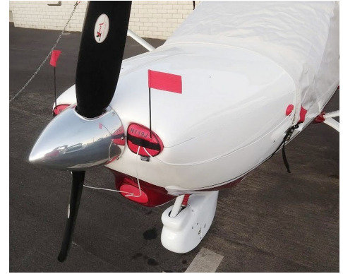
Jabiru 430 Engine Inlet Plugs