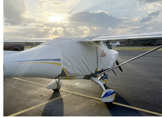
Jabiru J230-SP Extended Canopy Cover