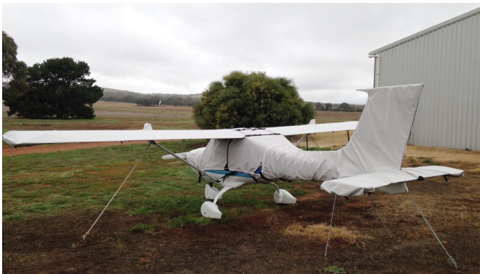
Jabiru 160 Canopy, Engine, Prop, Wings & Empennage Covers Jabiru 160 Canopy, Engine, Prop, Wings & Empennage Covers