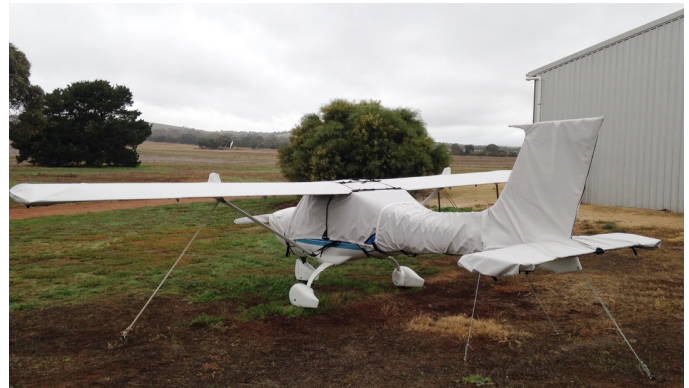
Jabiru 160 Canopy, Engine, Prop, Wings & Empennage Covers Jabiru 160 Canopy, Engine, Prop, Wings & Empennage Covers