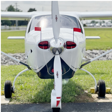
Jabiru J230-SP Engine Inlet Plugs