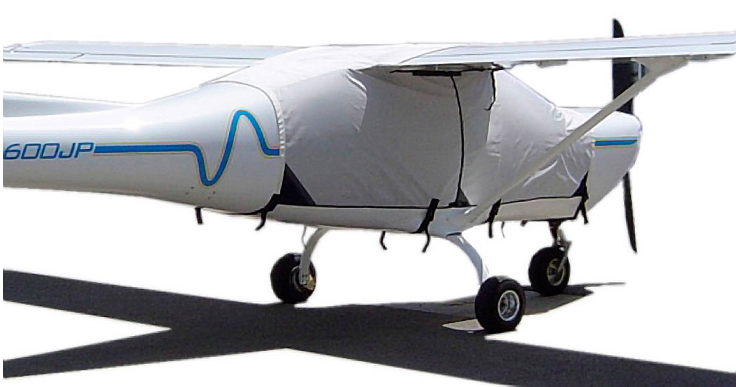
Jabiru Extended Canopy Cover