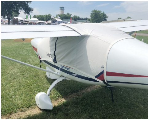
Jabiru J250 Canopy Cover