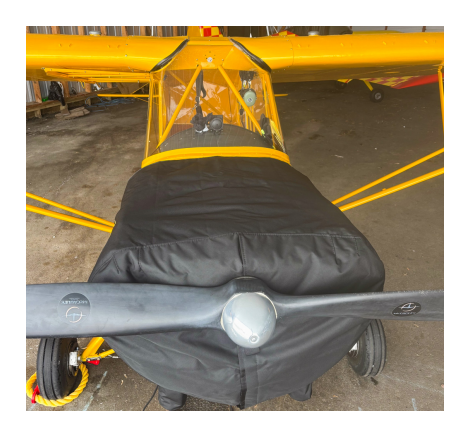
Piper J3 Cub Insulated Engine Cover