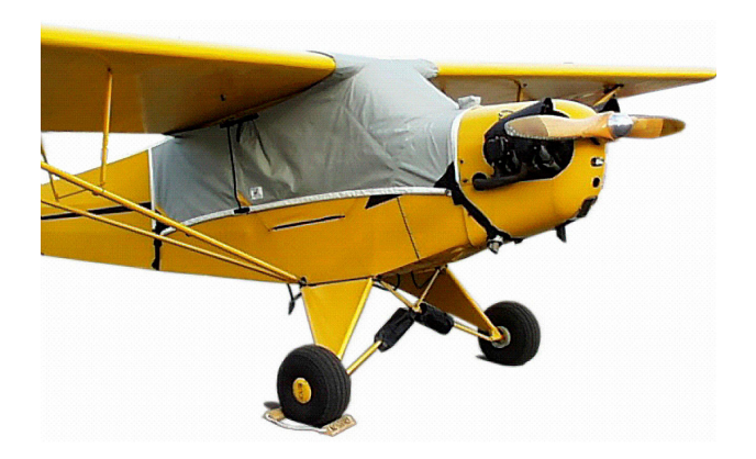
Piper J3 Canopy Cover

This cover type is made from Silver Acrylic Sunbrella canvas and is 100% lined with a soft and smooth microfiber. Bruce's Custom Covers developed this material combination especially for aircraft protection. The outer material is medium weight and treated for water resistance, UV resistance and anti-static buildup. The inner lining is a very soft and smooth microfiber to prevent scratching. The material is very reflective, and tests show that the cabin interior temperature can be reduced to near-ambient temperature on the hottest of days. It is water, ice and snow repellent, yet breathable to allow moisture to escape from between the cover and the aircraft surface.