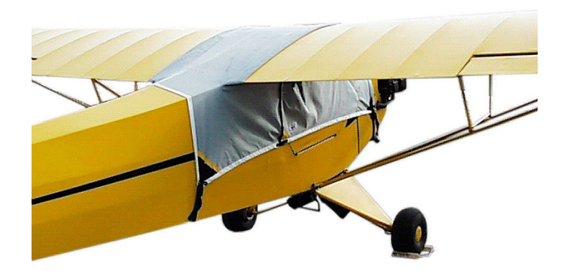
Piper J3 Over-Top Canopy Cover

This cover type is made from Silver Acrylic Sunbrella canvas and is 100% lined with a soft and smooth microfiber. Bruce's Custom Covers developed this material combination especially for aircraft protection. The outer material is medium weight and treated for water resistance, UV resistance and anti-static buildup. The inner lining is a very soft and smooth microfiber to prevent scratching. The material is very reflective, and tests show that the cabin interior temperature can be reduced to near-ambient temperature on the hottest of days. It is water, ice and snow repellent, yet breathable to allow moisture to escape from between the cover and the aircraft surface.