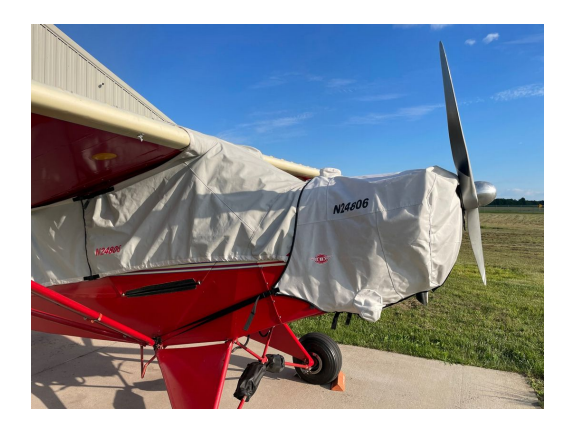
Piper J3 Cub Travel Weight Canopy & Engine Cover