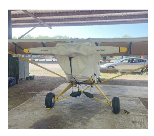
Piper J-3C-65 Cub Engine Cover, Fully Enclosed