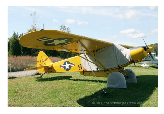
Piper L-21b Extended Canopy Cover, Tire Covers

ALL-YEAR USE MATERIAL - Made with Silver Acrylic Sunbrella canvas, the all-year use material is the best option for sun protection and cover longevity. This heavier more durable material is intended for all weather conditions, such as rain and snow or lots of sun.