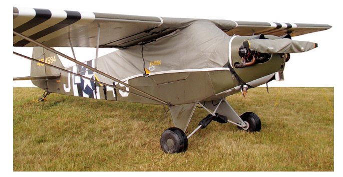
Piper J3 Extended Canopy Cover & Propellor Cover