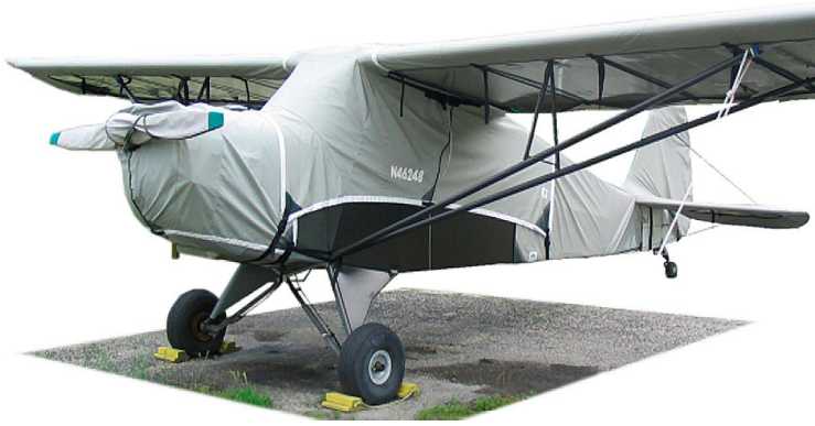
Prop Cover, Engine Cover, Canopy Cover, Wing Covers and Empennage Cover