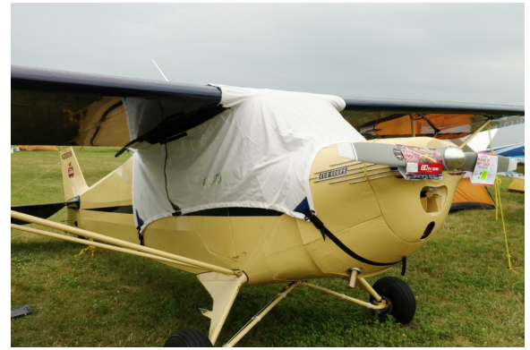
Prop Cover, Engine Cover, Canopy Cover, Wing Covers and Empennage Cover Piper J-4 Cub Coupe Canopy Cover (Over-Top)