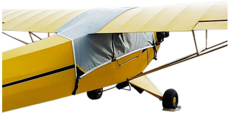
Piper J3 Over-Top Canopy Cover