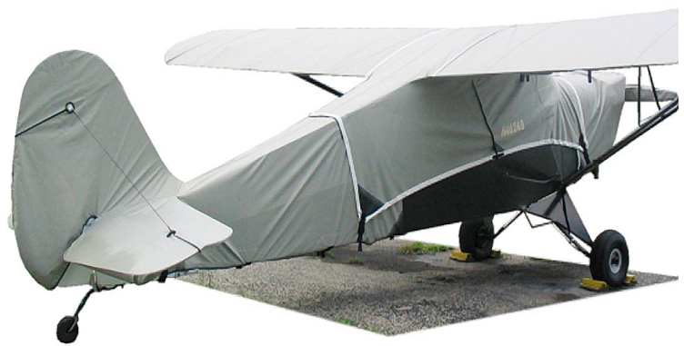
Taylorcraft L-2 Grasshopper Prop, Engine, Canopy, Wing and Empennage Covers