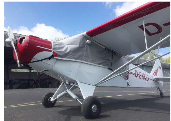
Piper Super Cub Travel Weight Canopy Cover