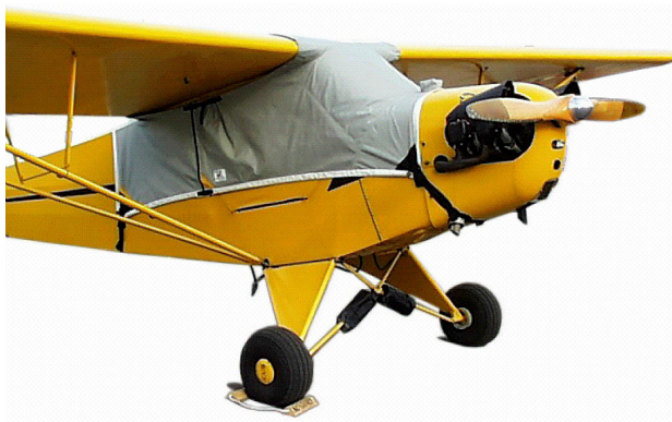
Piper J3 Canopy Cover

This cover type is made from Silver Acrylic Sunbrella canvas and is 100% lined with a soft and smooth microfiber. Bruce's Custom Covers developed this material combination especially for aircraft protection. The outer material is medium weight and treated for water resistance, UV resistance and anti-static buildup. The inner lining is a very soft and smooth microfiber to prevent scratching. The material is very reflective, and tests show that the cabin interior temperature can be reduced to near-ambient temperature on the hottest of days. It is water, ice and snow repellent, yet breathable to allow moisture to escape from between the cover and the aircraft surface.