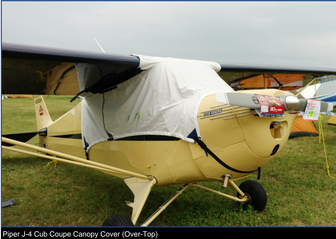
Piper J-4 Cub Coupe Canopy Cover (Over-Top)