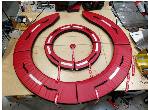
Boeing 747-8 Exhaust Plugs

The Engine Inlet Plugs are custom fit for your Boeing KC-46, KC-46A, Pegasus intakes, made with heavy-duty vinyl material, and stuffed with a single block of sculpted urethane foam. Each plug has a zipper that allows the foam to be removed and dried if necessary. Engine plugs have 'remove before flight' streamers sewn onto the face of the plugs. Most plugs are imprinted with the aircraft registration number in black for an extra charge. Storage bag NOT included. Engine plugs may be inserted after flight when the engine is still warm. Engine Inlet Plugs are commonly referred to as Cowl Plugs, Intake Plugs, Cowl Blocks, Engine Blocks, and Engine Bunges.