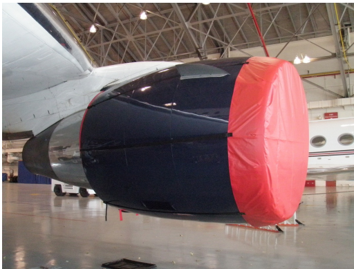
Boeing 767 Intake Covers Ship Set