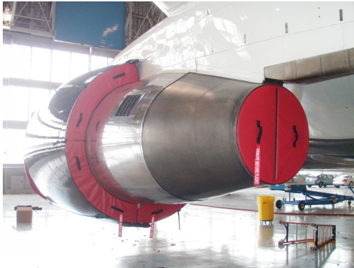
Exhaust Plugs Ship Set, incl. Fan Thrust Reverser and Exhaust Plugs P/N: B767-200

The Engine Inlet Plugs are custom fit for your Boeing KC-46, KC-46A, Pegasus intakes, made with heavy-duty vinyl material, and stuffed with a single block of sculpted urethane foam. Each plug has a zipper that allows the foam to be removed and dried if necessary. Engine plugs have 'remove before flight' streamers sewn onto the face of the plugs. Most plugs are imprinted with the aircraft registration number in black for an extra charge. Storage bag NOT included. Engine plugs may be inserted after flight when the engine is still warm. Engine Inlet Plugs are commonly referred to as Cowl Plugs, Intake Plugs, Cowl Blocks, Engine Blocks, and Engine Bungs.