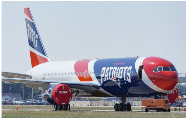
Boeing 767 Intake Covers