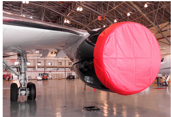
Boeing 767 Intake Covers Ship Set