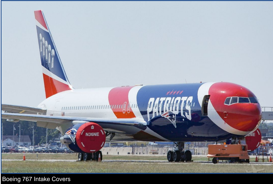
Boeing 767 Intake Covers