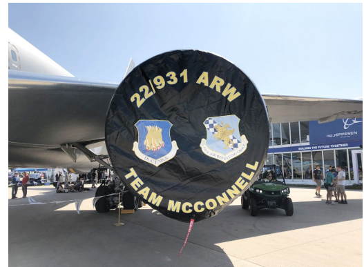
Boeing KC-46 Intake Cover