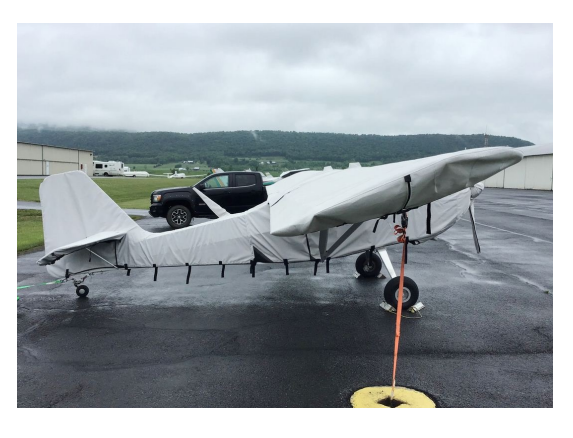
Skystar Kitfox Cover Set