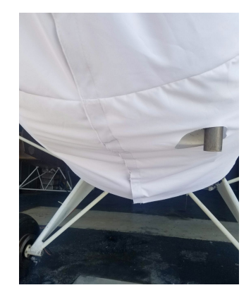
Kitfox Engine Cover, "Radial Cowl" type, test fit

This cover type is made from Silver Acrylic Sunbrella canvas and is 100% lined with a soft and smooth microfiber. Bruce's Custom Covers developed this material combination especially for aircraft protection. The outer material is medium weight and treated for water resistance, UV resistance and anti-static buildup. The inner lining is a very soft and smooth microfiber to prevent scratching. The material is very reflective, and tests show that the cabin interior temperature can be reduced to near-ambient temperature on the hottest of days. It is water, ice and snow repellent, yet breathable to allow moisture to escape from between the cover and the aircraft surface.