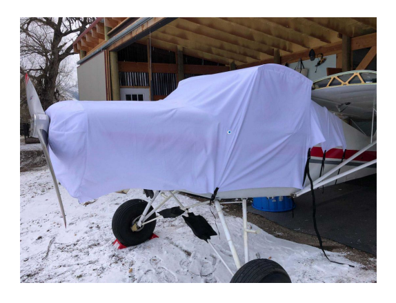
Kitfox Trailerable Canopy/Engine Cover, test fit cover