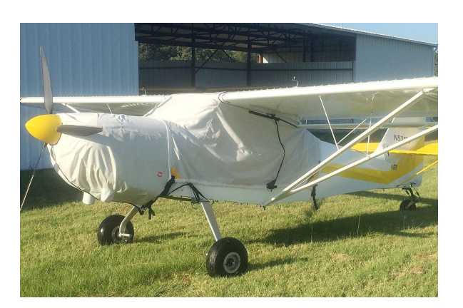
Kitfox Canopy & Engine Cover