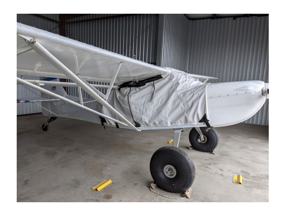
Kitfox Extended Canopy Cover, Over-Top Type

This cover type is made from Silver Acrylic Sunbrella canvas and is 100% lined with a soft and smooth microfiber. Bruce's Custom Covers developed this material combination especially for aircraft protection. The outer material is medium weight and treated for water resistance, UV resistance and anti-static buildup. The inner lining is a very soft and smooth microfiber to prevent scratching. The material is very reflective, and tests show that the cabin interior temperature can be reduced to near-ambient temperature on the hottest of days. It is water, ice and snow repellent, yet breathable to allow moisture to escape from between the cover and the aircraft surface.