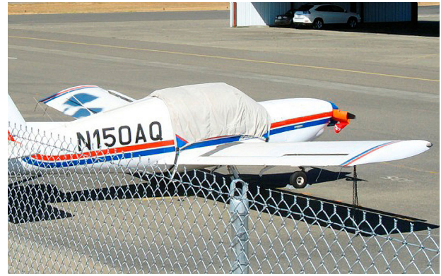
Koliber 150-A Canopy Cover