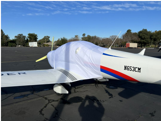
Jihlavan JA-600 Skyleader Extended Canopy/Engine Cover, test fit cover

This cover type is made from Silver Acrylic Sunbrella canvas and is 100% lined with a soft and smooth microfiber. Bruce's Custom Covers developed this material combination especially for aircraft protection. The outer material is medium weight and treated for water resistance, UV resistance and anti-static buildup. The inner lining is a very soft and smooth microfiber to prevent scratching. The material is very reflective, and tests show that the cabin interior temperature can be reduced to near-ambient temperature on the hottest of days. It is water, ice and snow repellent, yet breathable to allow moisture to escape from between the cover and the aircraft surface.