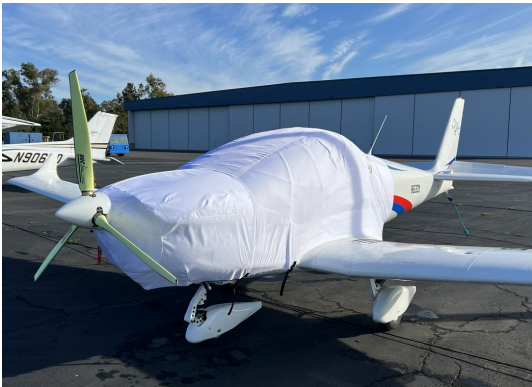
Jihlavan JA-600 Skyleader Extended Canopy/Engine Cover, test fit cover