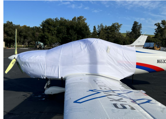
Jihlavan JA-600 Skyleader Extended Canopy/Engine Cover, test fit cover Jihlavan JA-600 Skyleader Extended Canopy/Engine Cover, test fit cover