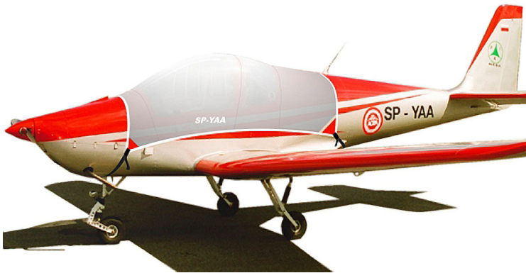
Kappa KP-5 Canopy Cover (illustration)

This cover type is made from Silver Acrylic Sunbrella canvas and is 100% lined with a soft and smooth microfiber. Bruce's Custom Covers developed this material combination especially for aircraft protection. The outer material is medium weight and treated for water resistance, UV resistance and anti-static buildup. The inner lining is a very soft and smooth microfiber to prevent scratching. The material is very reflective, and tests show that the cabin interior temperature can be reduced to near-ambient temperature on the hottest of days. It is water, ice and snow repellent, yet breathable to allow moisture to escape from between the cover and the aircraft surface.