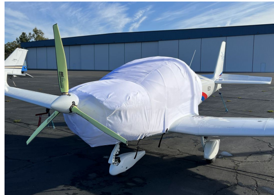
Jihlavan JA-600 Skyleader Extended Canopy/Engine Cover, test fit cover