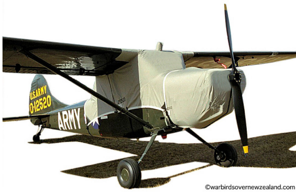
Cessna L-19 Canopy & Engine Covers

water resistance, UV resistance and anti-static buildup. The inner lining is a very soft and smooth microfiber to prevent scratching. The material is very reflective, and tests show that the cabin interior temperature can be reduced to near-ambient temperature on the hottest of days. It is water, ice and snow repellent, yet breathable to allow moisture to escape from between the cover and the aircraft surface.