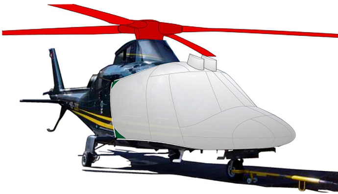
Agusta 109 Bubble, Rotor Hub & Blade Covers (illustration)