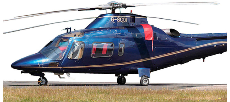
Agusta Power Intake Cover