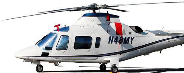
Agusta Power Pitot Covers, Intake Covers, and Cockpit Heatshield set

WINTER USE MATERIAL - Made with Solution-Dyed Polyester fabric, this option is intended for seasonal use to aid in deicing, rain mitigation, or for occasional travel. The material is lighter and more compact, but more susceptible to UV damage and may have a shorter useful life if used continuously outside than the all-year use material.