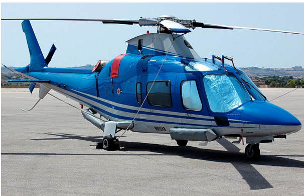
Agusta Power Cockpit HeatShields & Blade Tie-downs

Cabin Heatshields are interior sunshades for the aircraft's passenger cabin area. The product is a unique composite of closed-cell foam with a silver mylar finish. The semi-rigid design is stiff enough to stand inside the window framing. The set folds up flat and is easily stored in the included storage sleeve. Some designs may require velcro and suction cups. A Heatshield is an excellent short-term remedy for cockpit overheating, but an external fabric cover is more effective for long-term protection.