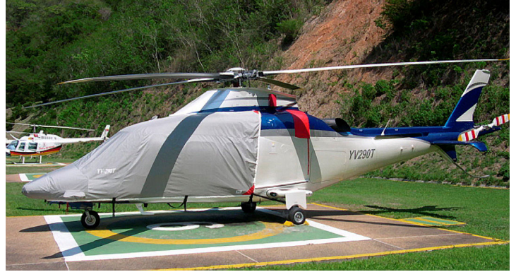
Agusta Grand Bubble Cover