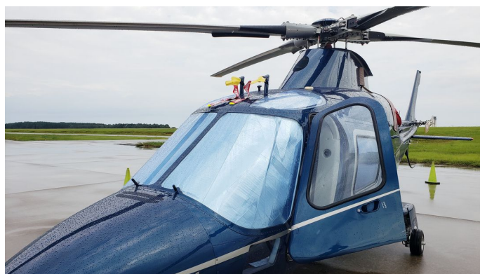
Agusta AW109S/SP Grand Heatshield Set