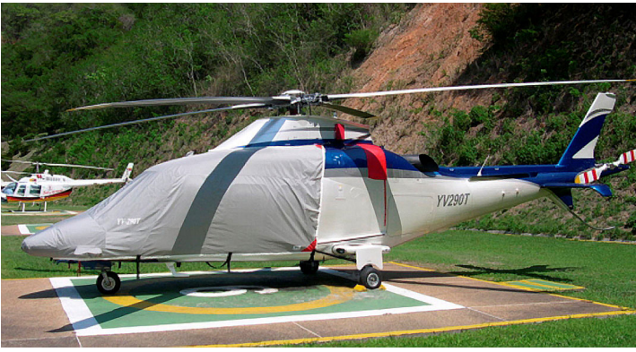
Agusta Grand Bubble Cover