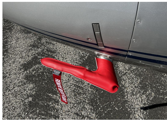
Agusta AW109 (A, C, & Trekker) Pitot Cover Set