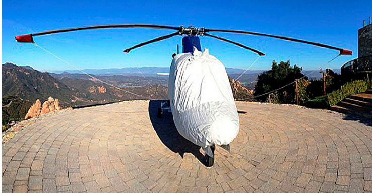
Agusta 109 Mk II+ Bubble Cover and Blade Tie-downs

Travel Covers are made with Silver Solution-Dyed Polyester fabric and fully lined over the entire cover. The material is lightweight and more compact for easy stowage in the aircraft. The polyester material is water resistant, but only intended for occasional use outside. We also have an ultra lightweight material available for fitted hangar dust covers. For daily outdoor use, the non-travel Sunbrella Cover is the best choice.