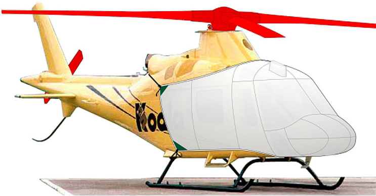
Koala Bubble, Rotor Hub, Blade & Tail Rotor Covers (illustration)