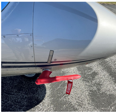
Agusta AW109 (A, C, & Trekker) Pitot Cover Set