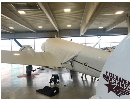
Lockheed 12 Canopy/Nose Cover

This cover type is made from Silver Acrylic Sunbrella canvas and is 100% lined with a soft and smooth microfiber. Bruce's Custom Covers developed this material combination especially for aircraft protection. The outer material is medium weight and treated for water resistance, UV resistance and anti-static buildup. The inner lining is a very soft and smooth microfiber to prevent scratching. The material is very reflective, and tests show that the cabin interior temperature can be reduced to near-ambient temperature on the hottest of days. It is water, ice and snow repellent, yet breathable to allow moisture to escape from between the cover and the aircraft surface.