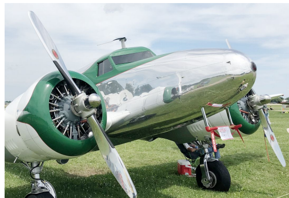
Lockheed 12 Pitot Covers