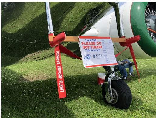
Lockheed 12 Pitot Covers

Lockheed 12 Electra Pitot Tube Covers , NOT HEAT RESISTANT TYPE, are made of Naugahyde vinyl, and are designed to cover the entire pitot assembly. Slipping over the tube, the cover tightens around the base with a Velcro strap detail. A "Remove Before Flight" streamer is attached to the cover. Heat Resistant Pitot Covers are an upgrade to this design, and help prevent the pitot cover from melting onto the tube if the pitot heat is accidentally turned on while installed. If you want the set tethered together, please let us know.