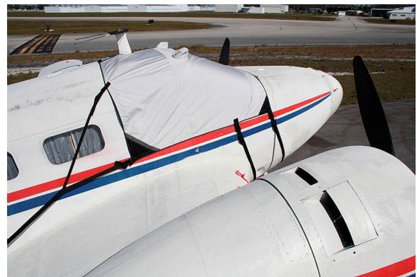
Beech 18 Cockpit Cover