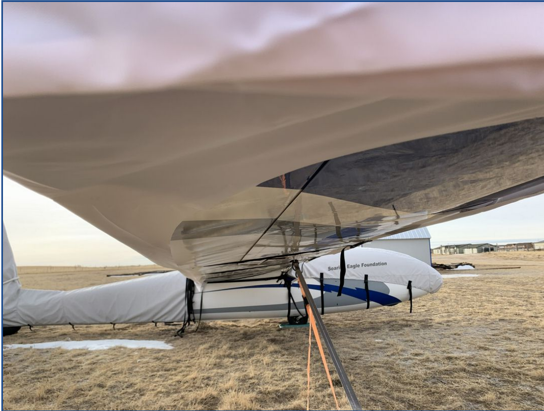
Blanik L-13 Canopy/Nose & Empennage Covers