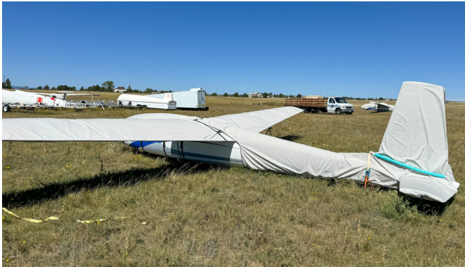
LET Blanik L-13 Empennage & Wing Covers

WINTER USE MATERIAL - Made with Solution-Dyed Polyester fabric, this option is intended for seasonal use to aid in deicing, rain mitigation, or for occasional travel. The material is lighter and more compact, but more susceptible to UV damage and may have a shorter useful life if used continuously outside than the all-year use material.