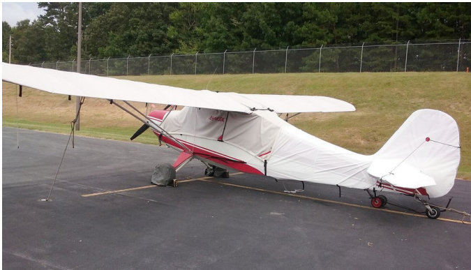
Aeronca Champ 7AC Empennage Cover, test fit