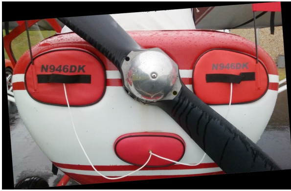
Aeronca Champ Entine Plugs