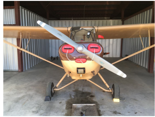
Aeronca Champ Engine Plugs, set of 3