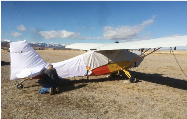
Aeronca Champ Canopy, Wings, Engine & Empennage (test fit) Covers

This cover type is made from Silver Acrylic Sunbrella canvas and is 100% lined with a soft and smooth microfiber. Bruce's Custom Covers developed this material combination especially for aircraft protection. The outer material is medium weight and treated for water resistance, UV resistance and anti-static buildup. The inner lining is a very soft and smooth microfiber to prevent scratching. The material is very reflective, and tests show that the cabin interior temperature can be reduced to near-ambient temperature on the hottest of days. It is water, ice and snow repellent, yet breathable to allow moisture to escape from between the cover and the aircraft surface.