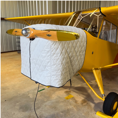
Aeronca 7AC Insulated Hangar Blanket, interior use