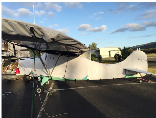
Aeronca 7AC Full Cover Set