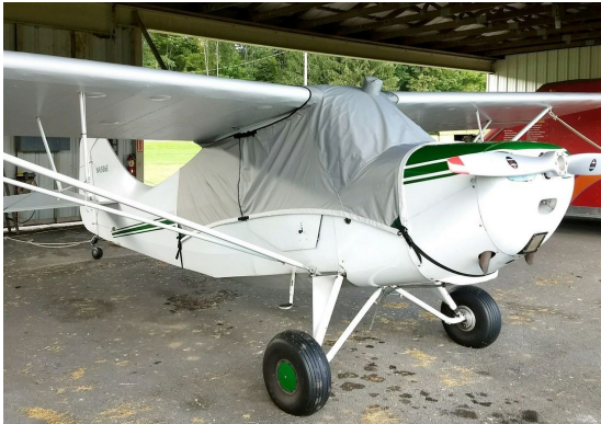
Aeronca Champ Light Weight Travel Canopy Cover, Over-Top Style

This cover type is made from Silver Acrylic Sunbrella canvas and is 100% lined with a soft and smooth microfiber. Bruce's Custom Covers developed this material combination especially for aircraft protection. The outer material is medium weight and treated for water resistance, UV resistance and anti-static buildup. The inner lining is a very soft and smooth microfiber to prevent scratching. The material is very reflective, and tests show that the cabin interior temperature can be reduced to near-ambient temperature on the hottest of days. It is water, ice and snow repellent, yet breathable to allow moisture to escape from between the cover and the aircraft surface.