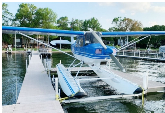
Aeronca 7GC Amphib Cover Set, BEFORE